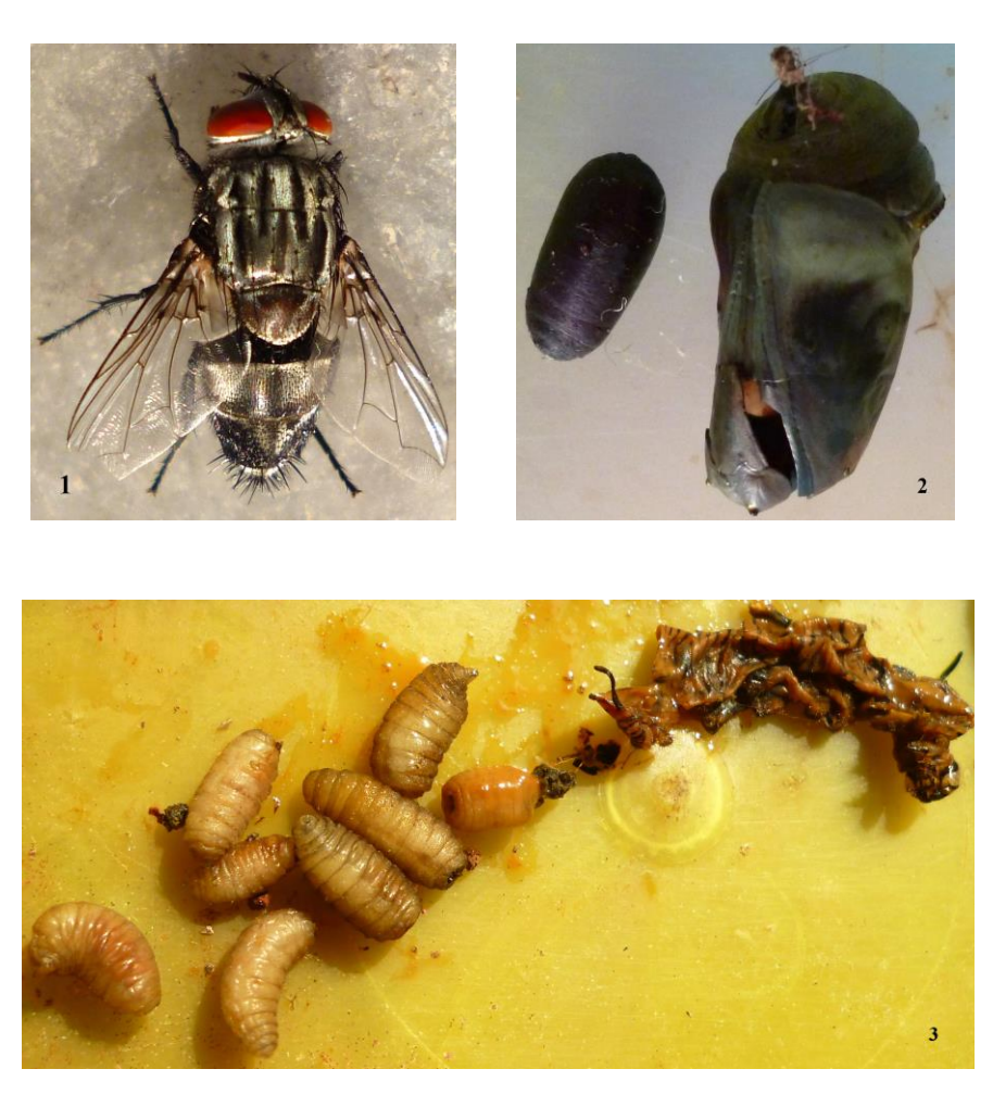
Figs. 1-3: Sturmia convergens 1 . Adult; 2 . Pupa of S. convergens along with host pupa with emergence hole; 3 . Emerged maggots and the host caterpillar.