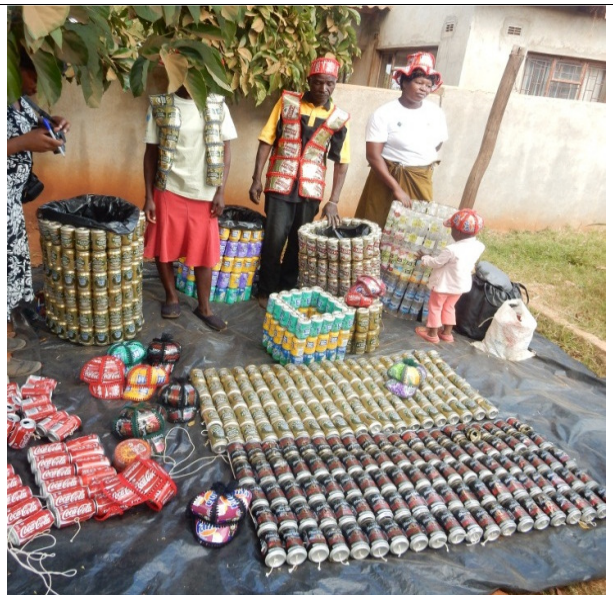
7b. Bin and hat making by Dhodhadhobha Waste Management Group