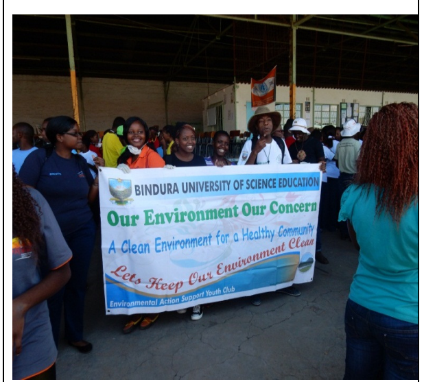
Figure 6a: Bindura University Clean Up and Awareness Campaign

(Figure 6b) and clean-up campaigns (Figure 6a). Practical Action facilitated the establishment of 24 community health clubs, 6 school health clubs and 6 market health clubs which served as structures for cascading health and waste management information in both community and at schools. During the period under review, 83 educative sessions were conducted on waste separation, recycling and reuse.