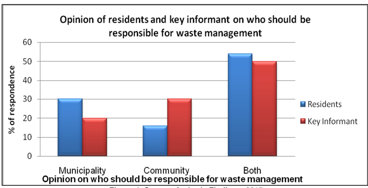
Figure 4: Source; Author's Findings, 2015

The majority (54%) of the respondents from the community and half (50%) of the key informants concurred on the need for partnerships in order to achieve sustainable solid waste management. Both groups agreed on the need to adopt waste separation and composting at both household and community levels as an effective strategy for improving waste management.