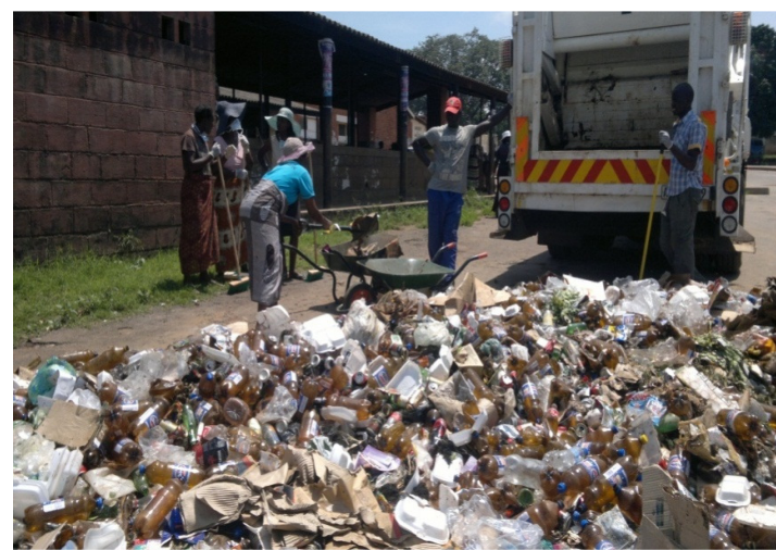
Figure 1: Waste dumping of new opaque beer bottle at Chipadze, Bindura

waste disposal problems as indicative of economic policy failures at either local authorities or national governments.