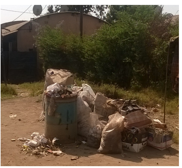
Figure 5: Bins placed on the road for collection in Ward 11 Chipadze

The hygiene promotion project by Practical Action in Bindura focused on educating residents on the need to be responsible to their environment with special focus on waste reduction, recovery and recycle. Through the Citizen Supporting Service Delivery approach, the intervention also educated the residents to participate in service delivery through various methods. Awareness on waste management was raised through various methods including health club sessions, road shows