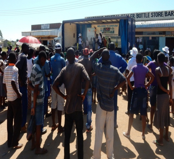
Figure 6b. Waste Management Awareness Road show in Bindura