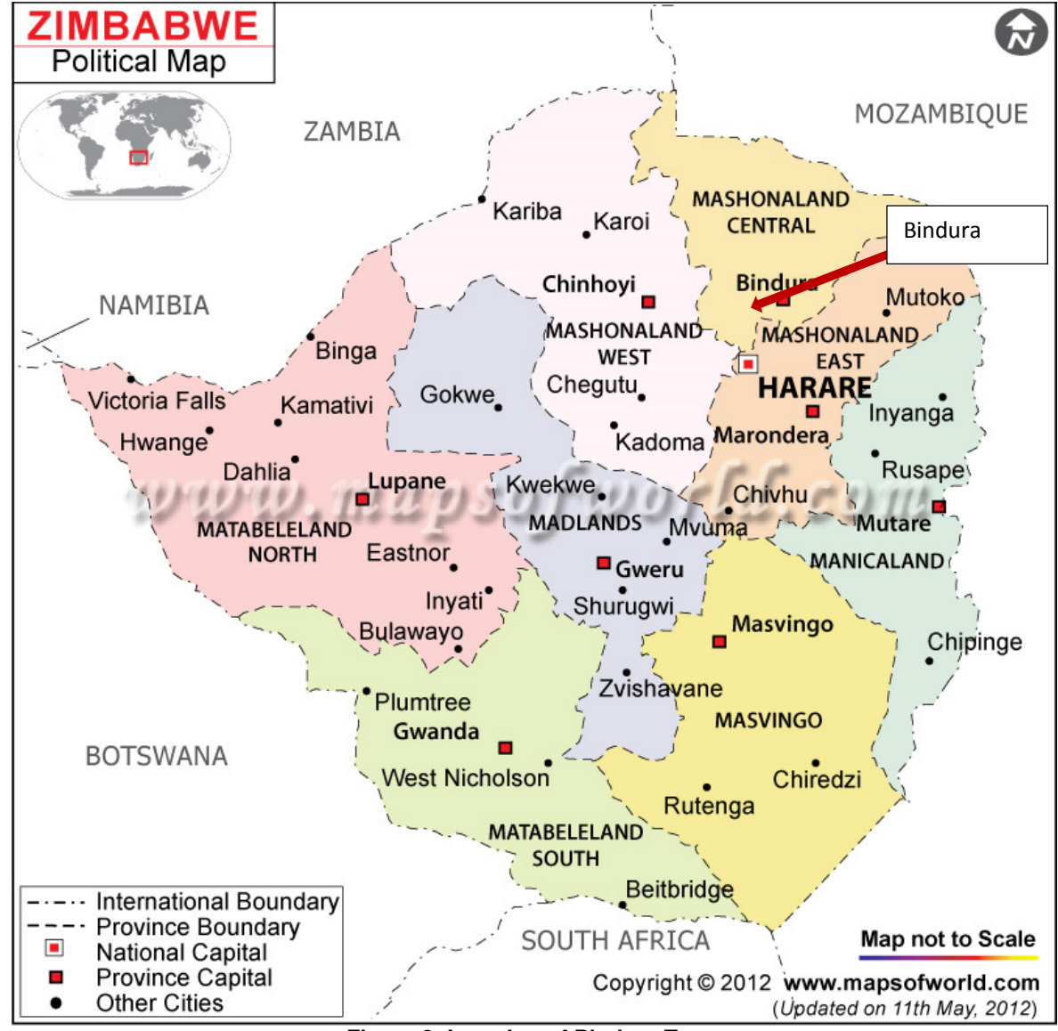
Figure 2: Location of Bindura Town