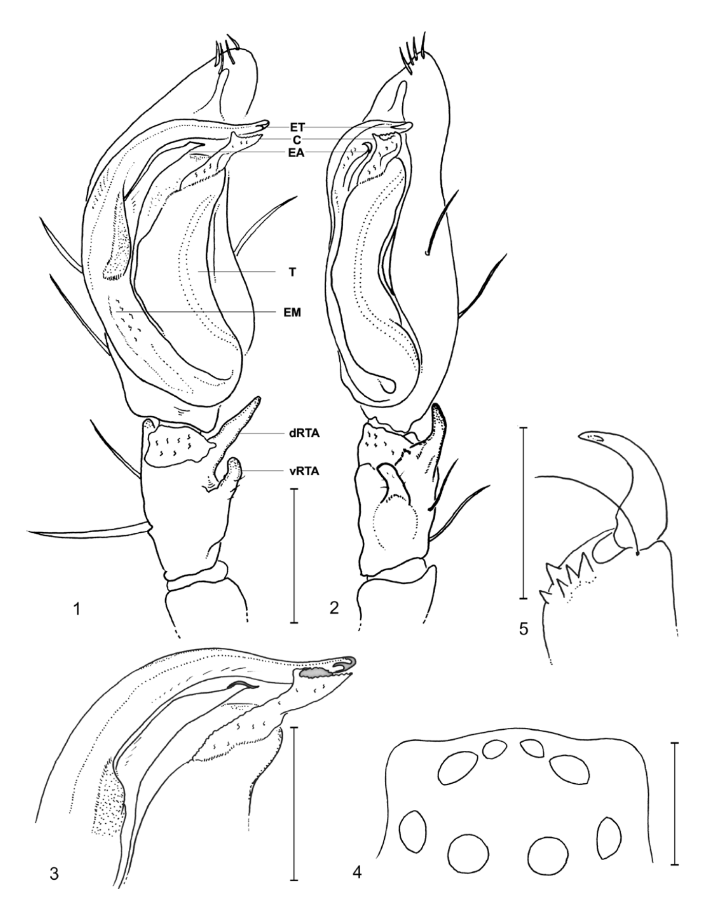
Figs 1-5. Pseudomicrommata mokranica sp. nov., male holotype, Iran. (1-2) Left palp, ventral and retrolateral views. (3) Distal part of tegulum, with embolus tip, embolic apophysis and conductor, ventral view. (4) Eye arrangement, dorsal view. (5) Left chelicera, ventral view. Scale bars = 1.0 mm.