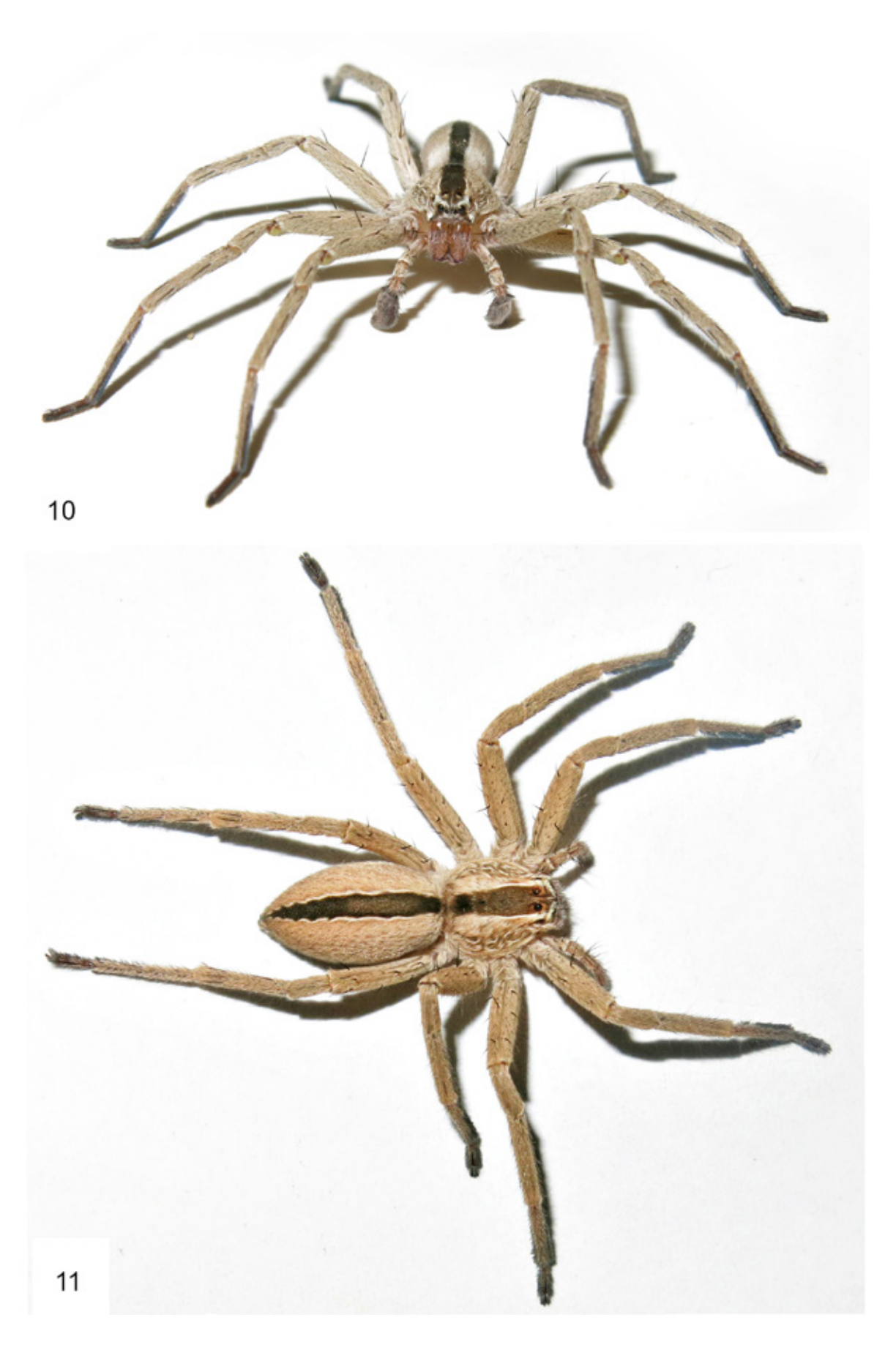
Figs 10-11. Pseudomicrommata mokranica sp. nov., habitus of male, anterior view (10) and of female, dorsal view (11).