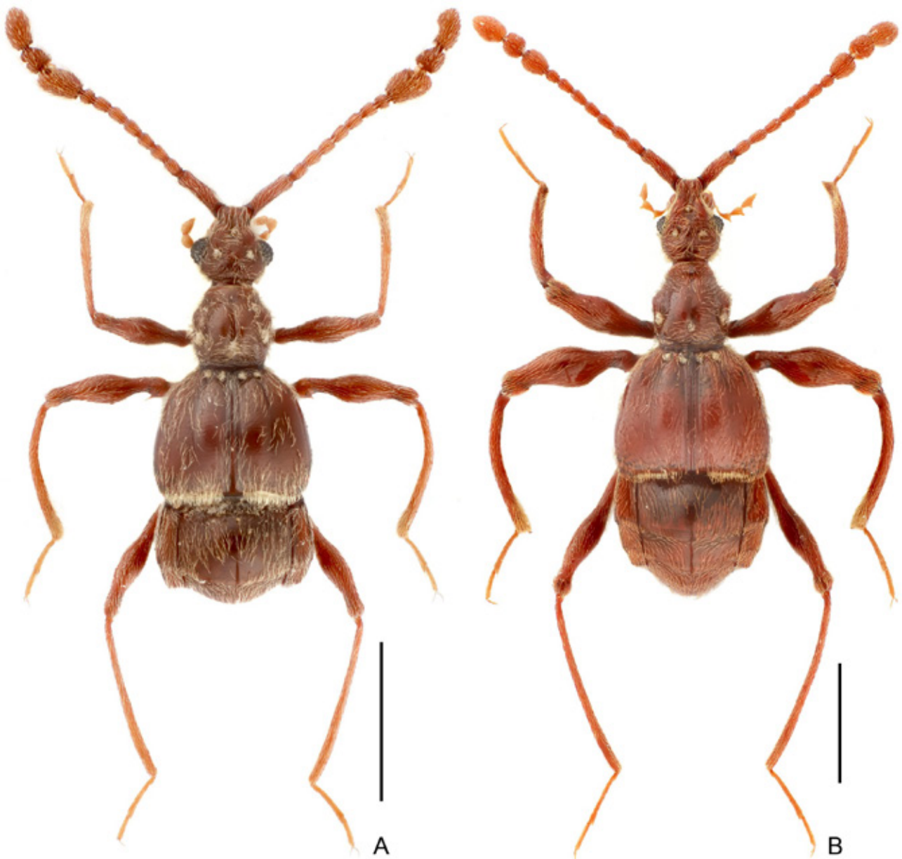
Fig 1. Male habitus of Labomimus consimilis sp. nov. (A) and Pselaphodes lianghongbini sp. nov. (B). Scale bars: 1 mm.