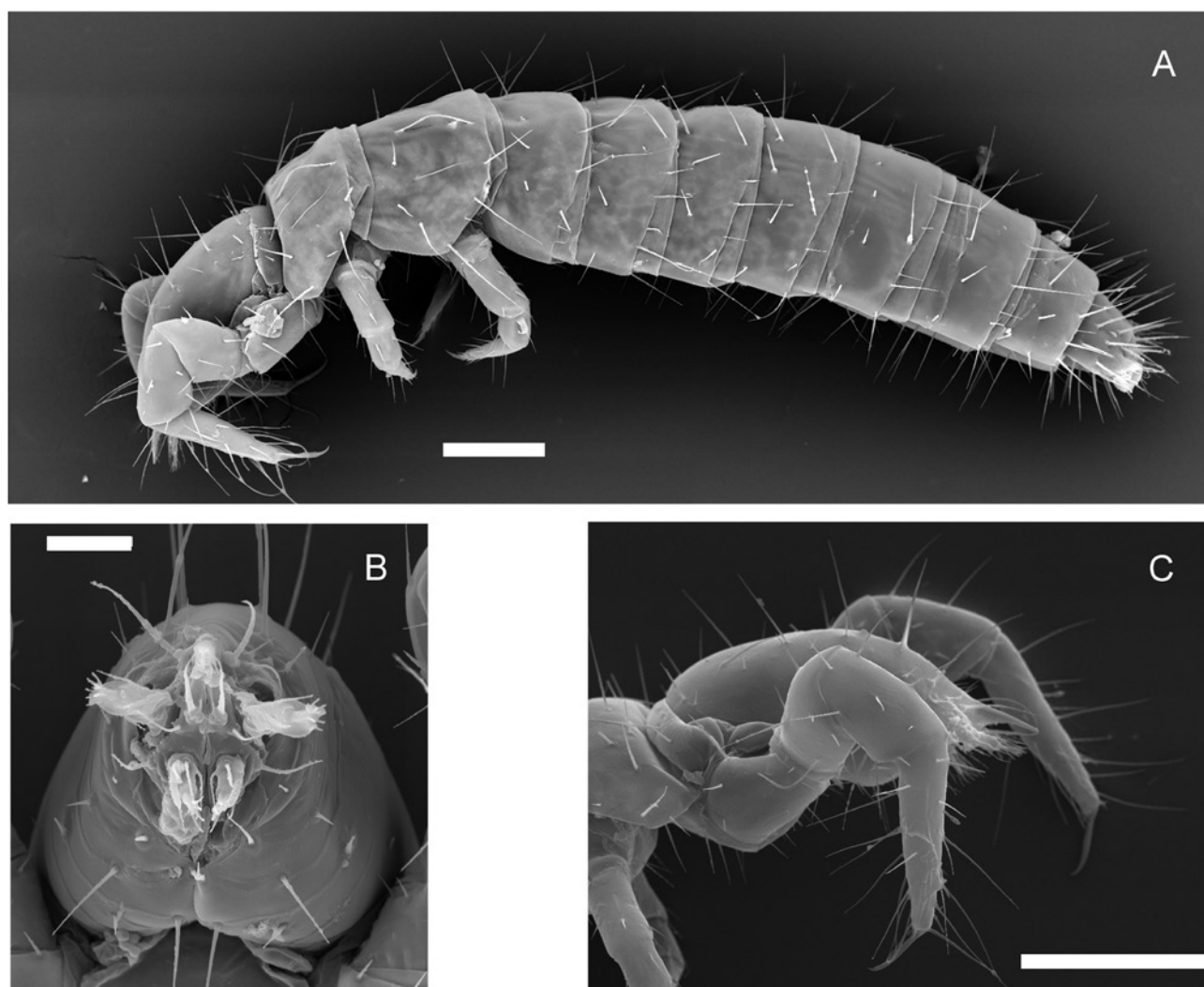
Fig. 1. Acerentomon italicum (SEM-micrographs). (A) Lateral view of whole specimen. (B) Detail of rostrum and entogathous mouthparts in frontal view. (C) Detail of anterior part of body with typical position of front legs directed forward as main sensory organs. Scale bars: 100 \mu\text{m} (A) and (C), 20 \mu\text{m} (B).

summarizes almost all relevant data available from the literature in order to better understand the ecology of these arthropods.