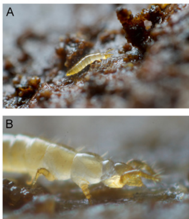
Fig. 3. Acerentomon specimen feeding on the ground of a beech ( Fagus sylvatica ) forest near East Pennard, UK. (A) Whole animal. (B) Detail of anterior part of body (legs and rostrum clearly visible).

Protura are secondary consumers in the decomposition subsystem of terrestrial ecosystems. They are part of the detritus-based food web and depend on the energy obtained from feeding on fungal hyphae (the so called “fungal energy channel” – see Wardle, 2002) (Fig. 3). Their mouthparts are well adapted to sucking. Sturm (1959) reported Acerentomon sp. and Eosentomon transitorium feeding on beech ectomycorrhizal fungi (EMF). Likewise, Stumpff (1990), studying Protura population dynamics in spruce forests in Germany, concluded that specimen numbers correlated positively with the abundance of EMF. Malmström & Persson (2011) tested Stumpff’s hypothesis via tree-girdling experiments in Picea abies and Pinus sylvestris forests in northern Sweden. Tree girdling was assumed to stop the flux of carbohydrates to roots and associated fungi, thereby inhibiting growth and long-term survival of EMF. About one year after girdling proturan abundance decreased, indicating that they prefer feeding on EMF. Similarly, Sterzyńska et al. (2012) observed that differences in