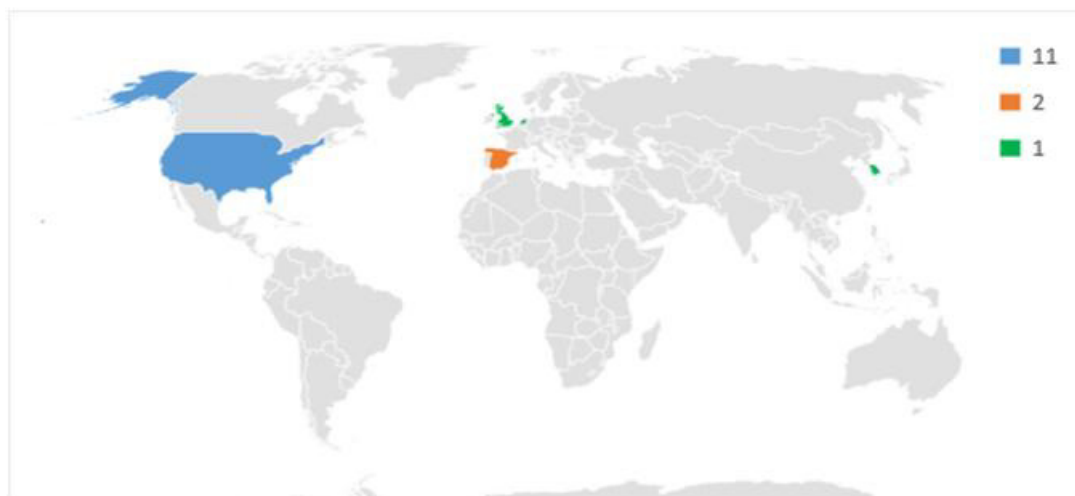
Figure 1. Articles of implementation of ICT in VBHC and impact of ICT on the VBHC delivery, outcome and cost, based on country of publication

and evidence-based library and information practice critical appraisal checklist for epidemiological studies. Any disagreements were resolved through discussion with arbitration and comments by an additional reviewer if necessary.