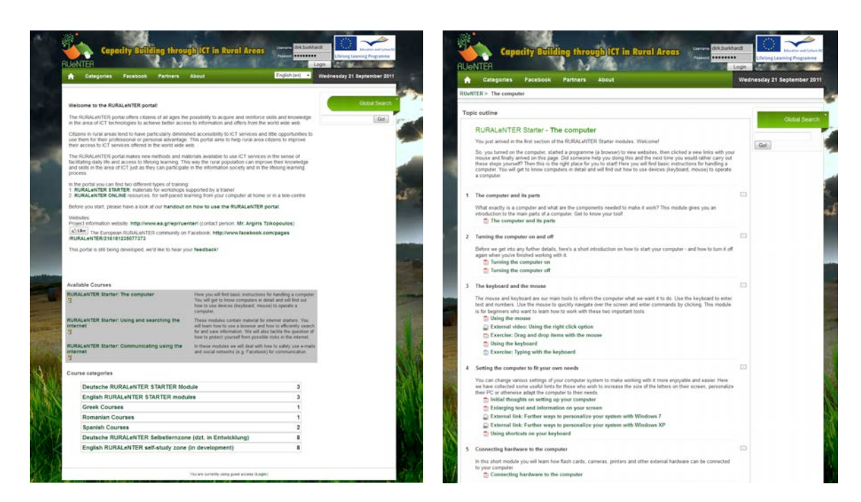
Figure 2. Screenshot of the RURALeNTER portal (left: frontpage, right: course view)

For achieving this goal, a concept for facilitation by simplification and user experience was developed [2]. The simplification comes along with the functionality reduction, but this reduces the possibilities too. To avoid this side-effect, a role-based approach was realized. The integration of 4 hierarchical roles enables the possibility, that with every higher role the functionalities increase too. The lowest role is that of an unregistered visitor, which just have read access to the courses and the learning materials. A registered visitor gets also the possibility to write comments and get in contact with other portal users. The role of trainers has further functionalities for adding and organizing courses and course materials. The highest role is defined for administrators. They can also change general portal configurations. But simplification addresses also the entire website navigation and the way to provide the content. The identified users that are addressed with this project are often computer beginners. To offer them a website which they are able to use and understand must be easy and clearly defined. So the menu is reduced to a single item, and there is also just one content area. The navigation structure which is displayed to the learners (rural users) is flat so it does not become too difficult to understand the page structure.