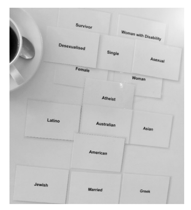
Fig. 2 Claudia's Card Identifiers. 15 white cards with writing photographed on a table displayed in hierarchical order starting from inner (high identification) to outer (lower identification)

The women who participated were recruited via snow-balling sampling where word-of-mouth and disability and social networks were major avenues of recruitment [7]. All 19 women participated in a semi-structured interview.