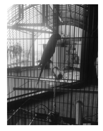
Fig. 4 One of Elizabeth's PhotoVoice images, her parrot in a wire bird cage

Elizabeth: "I feel I used to be the bird in the cage and the cage was society's expectations. A person with a disability isn't meant to drink, swear, smoke or have a sex life."