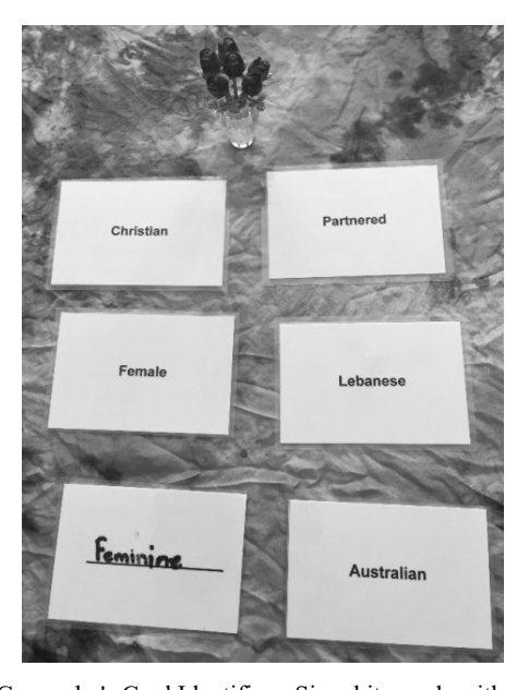
Fig. 3 Cassandra's Card Identifiers. Six white cards with writing photographed on a table displayed vertically higher to lower in hierarchical order

17 participants continued participating in PhotoVoice elicitation, enabling them to take four photographs representative of their sexuality and sexual expression. 17 women who participated in the PhotoVoice phase of the research participated in another semi-structured interview.