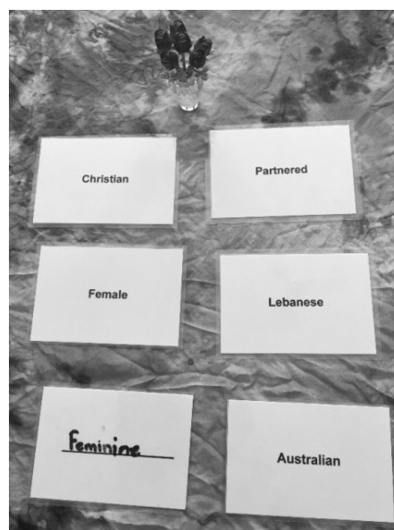
Fig. 3 Cassandra's Card Identifiers. Six white cards with writing photographed on a table displayed vertically higher to lower in hierarchical order

17 participants continued participating in PhotoVoice elicitation, enabling them to take four photographs representative of their sexuality and sexual expression. 17 women who participated in the PhotoVoice phase of the research participated in another semi-structured interview.