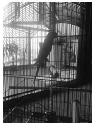
Fig. 4 One of Elizabeth's PhotoVoice images, her parrot in a wire bird cage

Elizabeth: "I feel I used to be the bird in the cage and the cage was society's expectations. A person with a disability isn't meant to drink, swear, smoke or have a sex life."