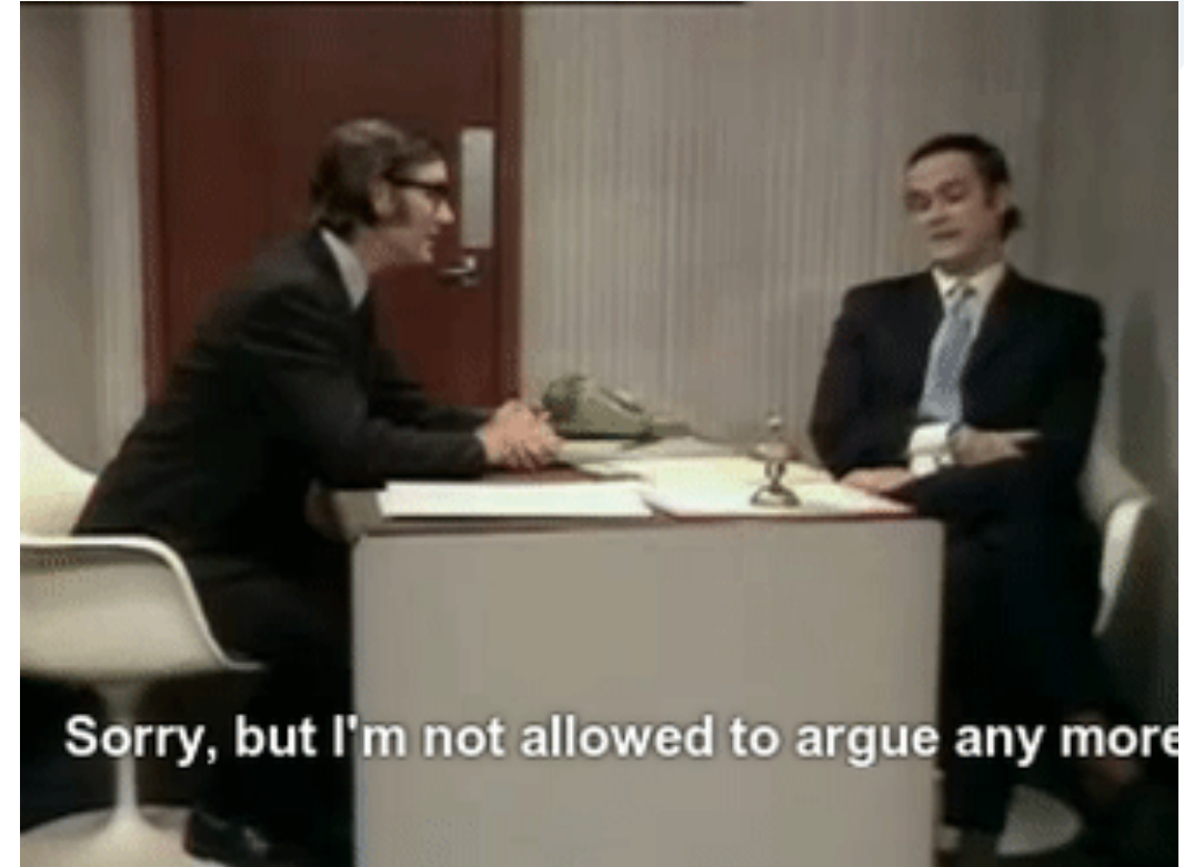
Monty Python – the argument sketch