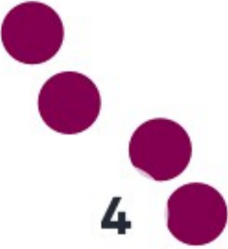
Funding agency/Government agency