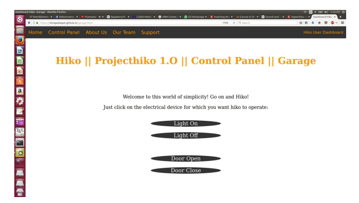
Figure 4. Buttons for the particular operations. The user has to click on desired button to operate.

This is the Control Panel of that particular room. It lists all the components which can be controlled using this webapp and includes the buttons to operate it.