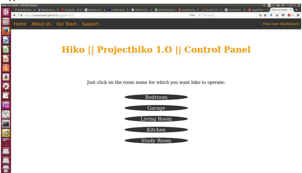
Figure 3 Control Panel of the house. Click on the room for which you want

The control panel visible in Figure 3 is for whole house. For a particular operation related to a particular room, one has to click on that button. Then a window would be shown like in Figure 4.