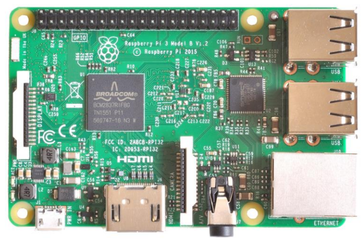
Figure 1. Raspberry Pi 3 Model B[7]

1) Raspberry Pi 3 Model B: Raspberry Pi 3 Model B is a small single-board computer, originally developed by the raspberry pi foundation to promote the teaching of computer science in schools. But later students started toinvolve it in robotics and hi-end computing. The Raspberry Pi 3 Model B uses a Broadcom BCM2837 SoC with a 1.2 GHz 64-bit quad-core ARM Cortex-A53 processor, with 512 KB shared L2 cache. It runs at 1GB DDR2 RAM. Its power rating is 700mA (3.5W). It is provided with 4*USB2.0 ports which can be used to connect keyboards and mouse. It has inbuilt wifi module and Bluetooth module unlike Raspberry Pi 2. Raspberry Pi 3 Model B features 802.11 b/g/n 2.4 GHz WLAN and Bluetooth modules. The Raspberry Pi has a set of GPIO(General Purpose Input Output) pins which can be programmed using the python library GPIO. We can take inputs, give outputs using these GPIO pins. It also has multiple "Ground", "5V", and "3.3V" pins mounted on it for convenience.