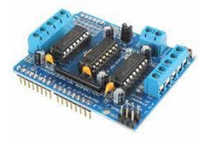
Figure 2. L293D Motor Driver[6]

H-bridge is a circuit which allows the voltage to be in either direction. As you know voltage need to change its direction for being able to rotate the motor in clockwise or anticlockwise direction, Hence H-bridge IC are ideal for driving a DC motor. We have used the motor driver to externally supply more voltage to LED's as well. 3) Sound Card: It is a simple input/output device which provides input and output to the computer when prompted by the computer programs to do so. They are DAC (Digital to Analog Converters).