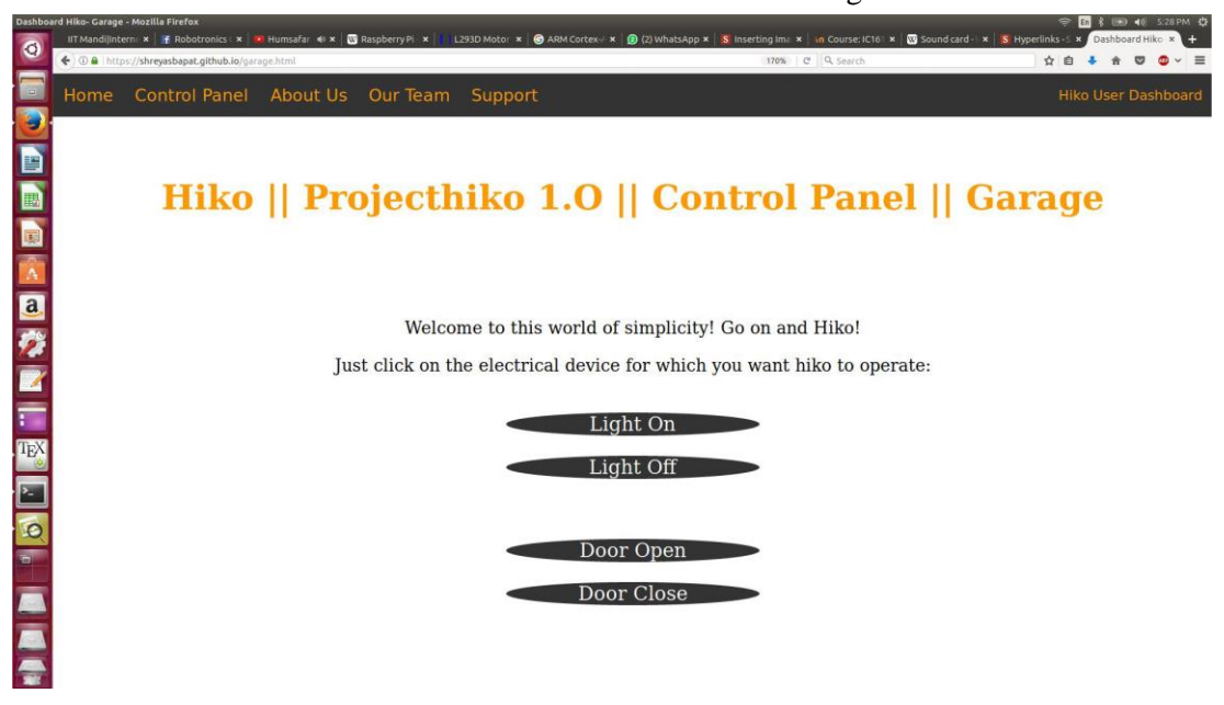
Figure 4 Buttons for the particular operations. The user has to click on the operation he wants

The control panel visible in Figure 3 is for whole house. For a particular operation related to a particular room, one has to click on that button. Then a window would be shown like in Figure 4.