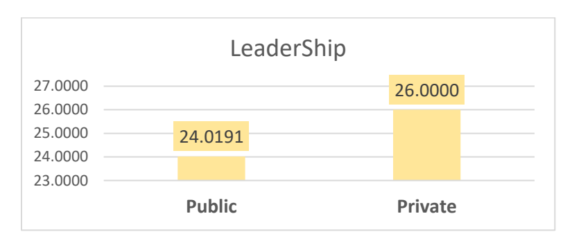
Figure 2: Mean Score for the indicator Leadership.

Table 3 indicates mean scores, standard deviation and means difference of Leadership and it contains t value 3.45 while p-value .001 which indicated a significant difference in Leadership of public and private sector universities and rejected the null hypothesis.