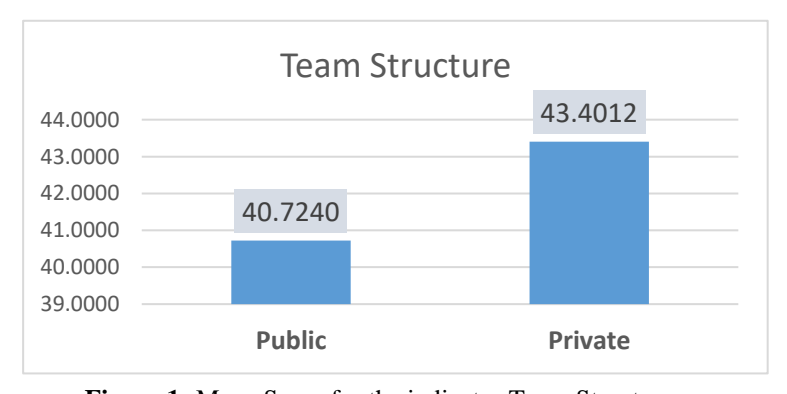
Figure 1: Mean Score for the indicator Team Structure.

Table 2 demonstrates mean difference of Team Structure in Public and Private sector universities as it contains t value 4.427 while p-value .001 which indicated a significant difference in Team Structure of public and private sector universities and rejected the null hypothesis.