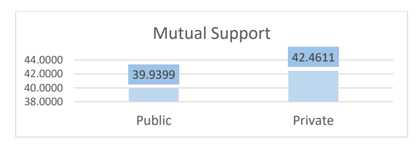
Figure 4: Mean Score for the indicator Mutual Support.

Table 5 demonstrates mean difference of Mutual Support and it contains t value 4.193 while p-value .000 which indicated a significant difference in Mutual Support of sectorial universities and rejected the null hypothesis.