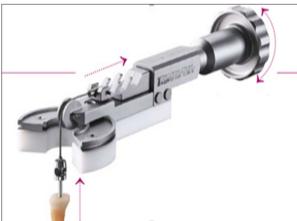
Fig. 2. The Benex system [25].

Although the BS was originally designed for the atraumatic extraction of the tooth, the clinicians expanded its horizons. This system consists of a screwdriver (which is threaded in the root after geometric widening and the creation of the pilot hole) – the connecting part between the tooth and the wheel pulley. In this way, the root being fixed with this device is towed dosed in millimeters, with balanced manipulations being quite easily routed.