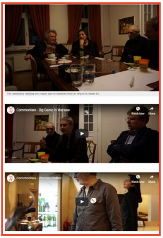
FIGURE 18. COMMONFARE IN WARSAW, POLAND

Residents of Smolna Street. Smolna was established in 2009 as a neighborhood organization working for the integration of residents and the activation of the local community promoting civic attitudes. One of the first goals they accomplished was a model restoration of an historic staircase, as well as security and renovation of a tenement house at Smolna 14, where their office is still located today. We organized introduction to common coin and sustainable economy to participants. The hall was populated by locals, Varsavians, and members of the association in a top location downtown. Our targeted group were members of the neighbourhood and other interested people, especially youth. The contributed to sustainability through project engagement of young people through playing again "Le Grand Jeu" board game. Three video interviews about the practices and problematics emerged in Poland.<sup>37</sup>