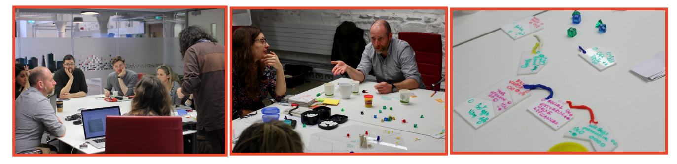
FIGURE 19. COMMONFARE WORKSHOP, DUBLIN, IRELAND

As services struggle for funding and greater collaboration between citizens is required to enhance social wellbeing, Context Studio was delighted to facilitate a visit to Dublin by dyne.org foundation as part of the EU Commonfare project.<sup>38</sup>