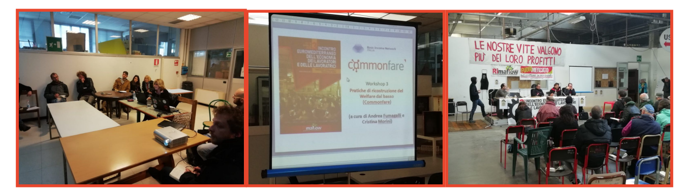
FIGURE 15. COMMONFARE AT RIMAFLOW, MILAN, ITALY

The Commonfare project actively participated this network event, bringing its own contribution of analysis and practice documentation, through the presentation of the commonfare.net platform as a possible tool for interconnecting different experiences of social and production self-management. In addition to plenary speech, Commonfare organized the workshop titled "Practices of welfare reconstruction from below", the 15th of April. At the meeting participated more than 200 people.<sup>28</sup>