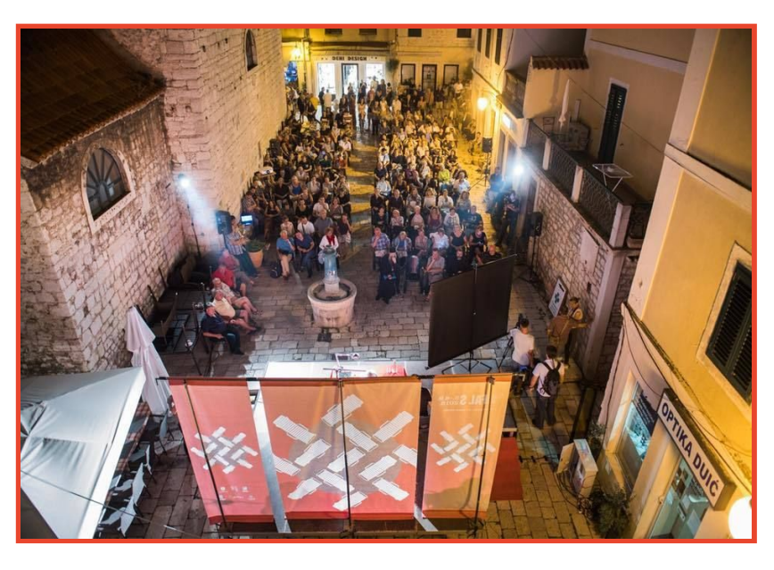
FIGURE 1. COMMONFARE PANEL AT FALIS FESTIVAL, SIBENIK, CROATIA

ideal place for the presentation of Commonfare exactly because it is frequented by those interested in new ideas and social solidarity. Also, by bringing together a digital platform, researchers working on sustainable tourism and a popular Festival of Ideas, this networking event facilitated inter-disciplinary and inter-sectoral information sharing and collaboration, and most importantly, inspired people to get informed, and get involved through commonfare.net and real-life networks.<sup>12</sup>