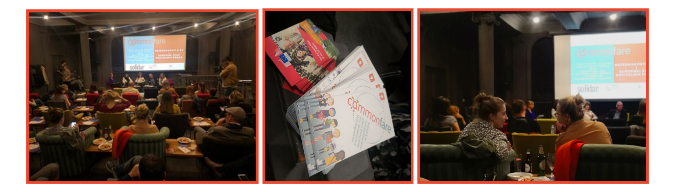
Figure 2. Commonfare panel, kino europa, Zagreb, Croatia