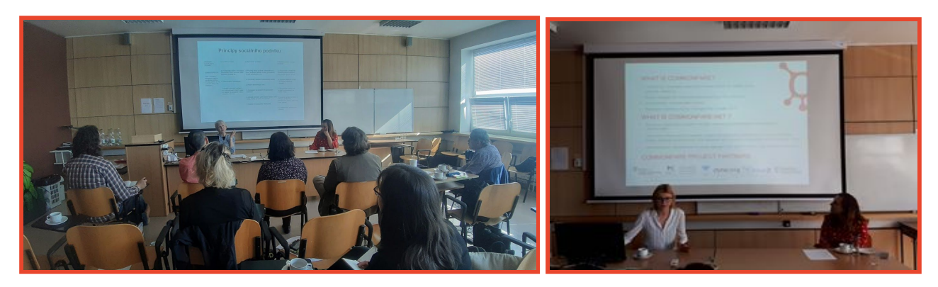
FIGURE 5. COMMONFARE WORKSHOP, PRAGUE, CZECH REPUBLIC

and social enterprise. Brochures for commonfare.net were handed out and a tutorial on the different functions of the platform was given in an informal setting after the presentations and discussions.<sup>17</sup>