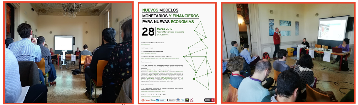
participated more than 50 people.<sup>2</sup>

minimum income. These are two of the many possible examples of experimentation with new forms of welfare from below and alternative monetary circuits, which can facilitate its operation. The Commonfare.net platform was just created to network these good practices. At the meeting