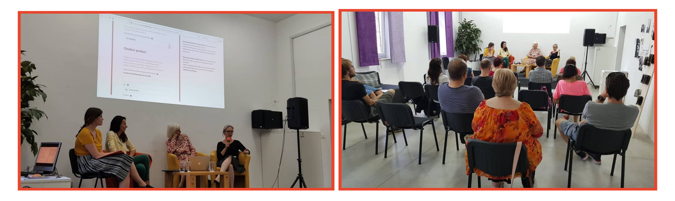
FIGURE 7. COMMONFARE EVENT, PULA, CROATIA

In terms of promotion of commonfare.net platform, this event was a success, as we had an opportunity to present it to relevant stakeholders in the region of Istria, a Western part of the country, where the housing crisis is especially strong with significant consequences for the population, especially youth, the unemployed people and those in precarious working conditions.<sup>19</sup>