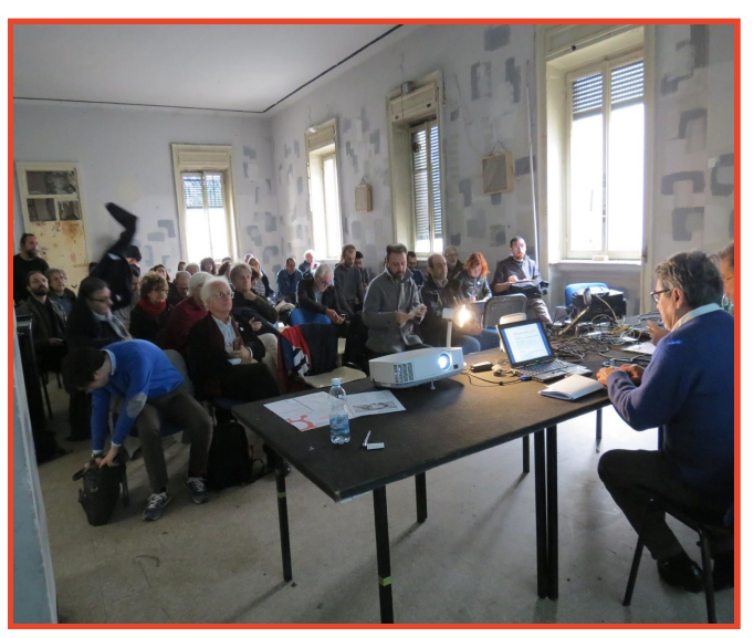
FIGURE 11. COMMONFARE AT MACAO, MILAN, ITALY

The possibility to promote social cooperation and new forms of mutualism: This aim is respectful of labour rights, with the right to self-determine life in terms of income, satisfaction and joy.