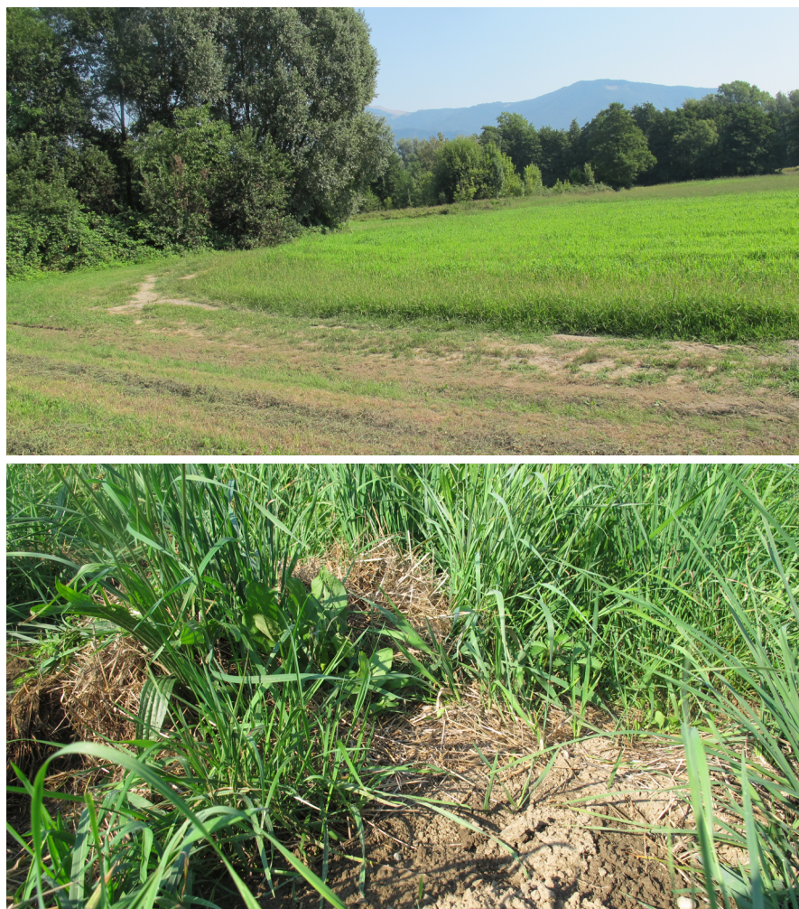
Fig. 2. Habitat of S. marginatus . All individuals were found on bare soil (tractor furrows, above; heaps of earth in the middle of a field, below) covered with plant remains (grass cuttings).

The 26 companion species encountered during the two-day search period (Tab. 1) are mostly species typical of agricultural landscapes (Luka et al. 2009). Catches of Tachyura hoemorrhoidalis (Ponza, 1805) and Agonum antennarium (Duftschmid, 1812), however, are particularly notable. These species were previously known from only two and three Swiss localities respectively, all also located in southern Ticino.