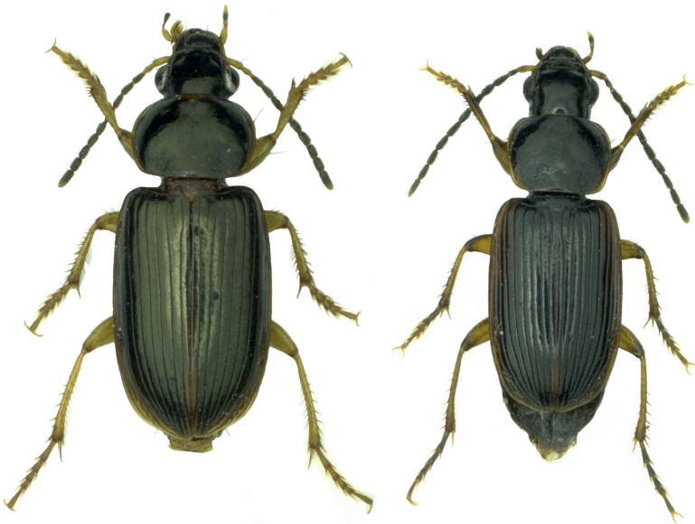
Fig. 1. Habitus of a male individual of S. marginatus (from Mendrisio TI, 12.VIII.2015, 5.4 mm), left, and of a male individual of S. mixtus (from Gy GE, 06.III.2015, 4.9 mm), right.

The first individual of S. marginatus was found under a clump of earth at the bottom of a furrow in a cornfield in southern Ticino. Following this discovery, the area was revisited two months later. Several other specimens were then found. All were under plant remains (grass cuttings) on bare soil (tractor trenches, mounds of earth) bordering cropland (Fig. 2). The substrate was slightly moist, while surrounding areas not covered by grass cuttings were dry.