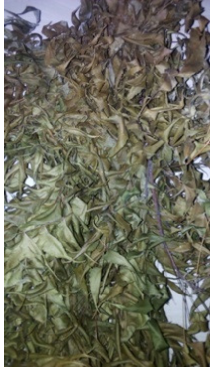
Figure 1. Dried Neem leaf