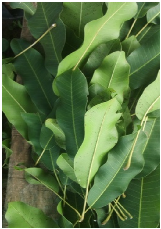
Figure 2. Freshly harvested Shear butter leaf