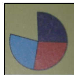
Figure 2. Broken Circle