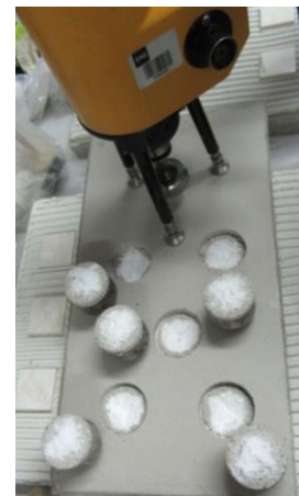
Fig. 8. Determination of bond strength (“pull off” test) on InnoWEE ETICs like panel

Based on the findings of Rilem TC DTA (Durability testings of alkali activated materials) which has set a series of methods for testing alkali activated materials (also geopolymer belongs to this group) regarding long term behaviour when exposed to severe conditions, also some parameter related to the durability have been tested or still being in progress [7]: