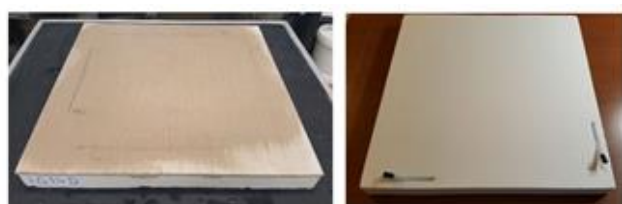
Fig. 4. InnoWEE radiant ceiling panels: front and back views

Radiant systems are designed for highly efficient low temperature heating and high temperature indoor cooling. The radiant panels have been designed and fabricated both for ceiling and wall application (Fig.4). Contrary to common plasterboard based radiating panels the InnoWEE panels are easy to dismantle and recycle due to the absence of gypsum in their formulation. The panels layout is a square of size equal to 59.5 cm that allows an easy mounting on common indoor ceiling systems that are designed for 60 by 60 cm tiles.