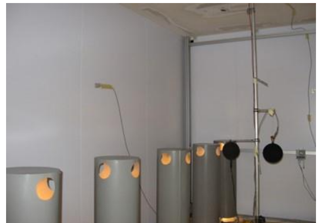
Fig. 10. View of the thermal chamber during a radiant ceiling test

The radiant panels prototypes are under testing in a dedicated test facility at the ITC-CNR laboratory in Padova [9]. The laboratory is a controlled test room where radiant panels could be installed and connected to a hot and cold water generation system. The facility is provided with a dedicated data acquisition and control system, that includes also the thermal dummies required by the standards, as shown in Fig. 10.