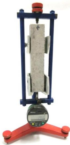
Fig. 9. Determination of alkali silica reactivity resistance of InnoWEE ventilated panel

Tests performed on panels from pilot productions confirmed that panels could be suitable for use as façade cladding. Capillary water absorption of panels after 24 hours was 1.8 \text{ kg/m}^2 , and testing of frost resistance has confirmed that there was no cracks or other type of damage after 30 cycles of freezing–thawing on both types of panels. Coefficient of water vapour permeability, which is relevant for ETICs like panels, was determined to be 44. By incorporating a mesh into the panels also impact resistance was improved, and it is now satisfactory for being used in Zone II group what means they are suitable for zone liable to impacts from thrown or kicked objects, but in public locations where the height of the ETICS will limit the size of the impact. Some long term durability tests are still in progress.