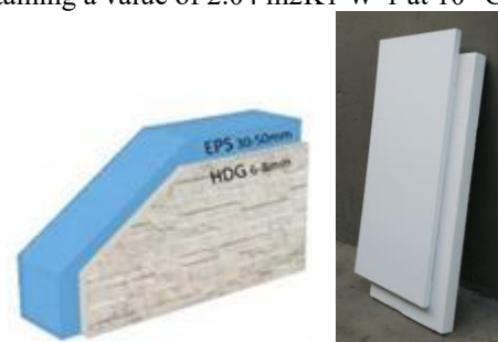
Fig. 2. InnoWEE ETICs panels: scheme (left) and panels produced in pilot production (right)

As opposed to conventional systems that are assembled on-site, in InnoWEE a new type of prefabricated ETICs was proposed. It consists of prefabricated insulating panels composed of an outer geopolymer layer and an inner EPS layer (Fig.2). The panels can be installed easily and fast, and they are extremely eco-friendly by using low CO 2 emissive geopolymer technology and recycling of large amounts of CDW (50% weight of the geopolymer binder). The panels are rectangular with a staggered layout, to facilitate the connection of adjoining panels and have a weight of 18Kg/sq m Substitution of individual panels can be done and easy end-of life recycling is guaranteed by their easy dismantling. The thermal resistance of the panels has been measured in laboratory, according to the EN 12667 standard, obtaining a value of 2.04 m 2 K/W-1 at 10 °C.