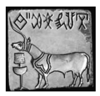
Fig.1 A seal with a one-horned animal. Probably a bull, with decorated blanket and neck, the animal is in front of a wedding pole and a basin [5].

The icons on seals are representing a single local animal, domesticated (long-horned and short-horned bulls, humped zebus, water buffaloes, goats) and savage (rhinoceroses, tigers, gavials and elephant) but also human beings in a yogic position. One of these icons is defined as the "Lord of the Beasts" shown a man seated cross-legged and wearing a water-buffalo headgear [4,5], in fact a "sitting buffalo". According to Ref.4 and 5, the animal is probably a totemic animal, that is the ancestor of a group of people or clan. The dominant image is accompanied by an item that could a basket, fountain, a sacred tree or a "stem" emblem such as one also shown being carried in processions. In Fig.1, a sketch of a seal with a one-horned animal is shown. Some archaeologists suggest that these seals were used for commerce purposes, or worn as a protective amulet [6,7].