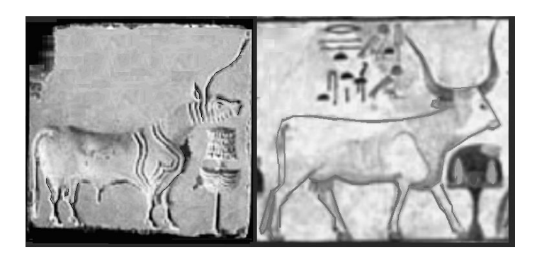
Figure 2. On a wall of the Nefertari's Tomb, we can see seven cows and a bull. In front of each animal there is an offering table. Adapted images of one of the cow (on the right) and of a Harappan bull (on the left) are shown for comparison.

The Egyptian Museum of Torino shows a beautiful "Book of the Dead": in the chapter about the cultivation of the fields of Osiris, we can see several images representing animals (cows, bulls, a superb lion) and in front an altar or an offering table. In the Book of Dead, we find several representations of a herd with seven cows and a bull<sup>1</sup>: this herd is also painted on several tomb walls. Figure 2 shows a sketch of one cow of the herd in the Nefertari's Tomb, compared with a domestic animal on a Harappan seal.