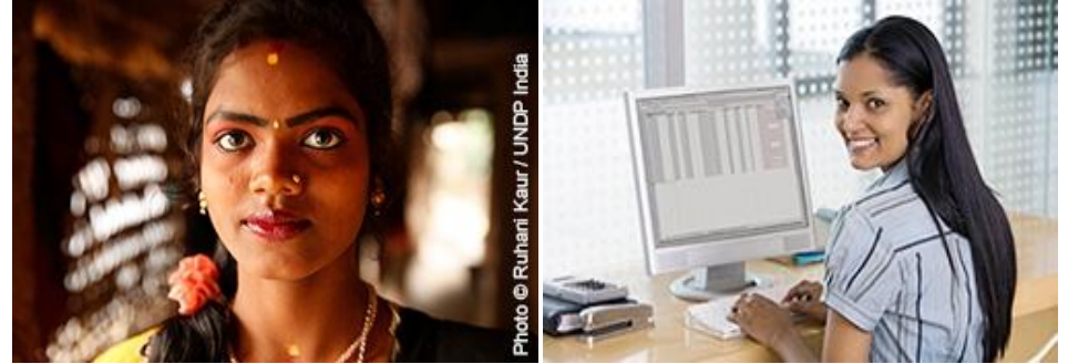
Figure 3: 2015 Picture of International Women's day

some striking There are examples of emancipation women oft quoted include the name of Meera Kumar, erstwhile speaker of Lok Sabha, Sushma Swaraj, Minister of External affairs, Chanda Kochar Chair person of ICCI Bank, Shika Sharma etc easily come to mind. Clearly, one swallow does not make a summer and more needs to be done. But the gross under utilization of women in Police, Judiciary etc are seen clearly. Gender inequalities, and its social causes, impact India's sex ratio, women's health over their lifetimes, their educational attainment, and economic conditions. Gender inequality in India is a multifaceted issue that concerns men and women alike. Some argue that some gender equality measures, place men at a disadvantage. However, when India's population is examined as a whole, women are at a disadvantage in several important ways. In India, discriminatory attitudes towards either sex have existed for generations and affect the lives of both sexes. Although the constitution of India has granted men and women equal rights, gender disparity still remains.