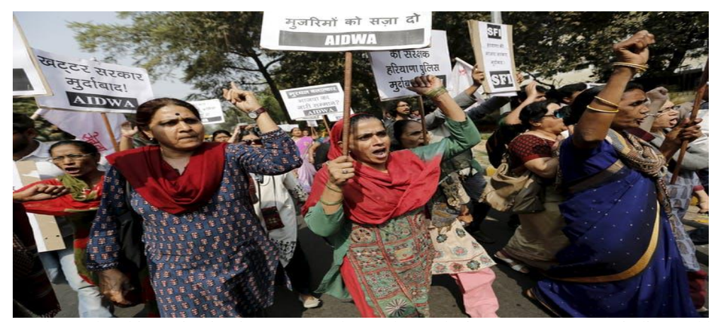
Figure 2: Women demand and investigation into rapes and sexual assaults in Haryana state.

Despite some basic changes in the status and role of women in the society, no society treats its women equally as well as its men. Consequently, women continue to suffer from diverse deprivations from kitchens to keyboards, from the cradle to the grave across nations. Historically women in India were revered and the birth of a girl was widely believed to mark the arrival of Lakshmi the Goddess of wealth and riches. Women have been considered 'Janani', i.e., the progenitor and 'Ardhangini' i.e., half of the body. Women are also considered to be an embodiment of Goddess Durga. Women have shouldered equal responsibilities with men. Widespread discrimination against women is, however, reflected in recurrent incidents of rape, acid throwing, dowry killings, wife beating, honour killings, forced prostitution, etc. Some of these issues were highlighted by 'Satyamev Javate' (Truth alone prevails) - an acclaimed television show hosted by Bollywood icon Aamir Khan.