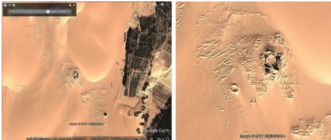
Figure 2: The location of the fort in an image of 2011. On the right, the fort of Qasr el-Baramoudy.

Let us consider this second fort (Qasr al-Baramoudy) in the Google Earth images (Figure 3). For this location, Google Earth is providing a rich time-series, that is, a series of images recorded at different time (actually, we have already used the time-series of Google Earth for the investigation of the motion of the barchans of the Kharga Oasis and of other locations [15, 22-27]).