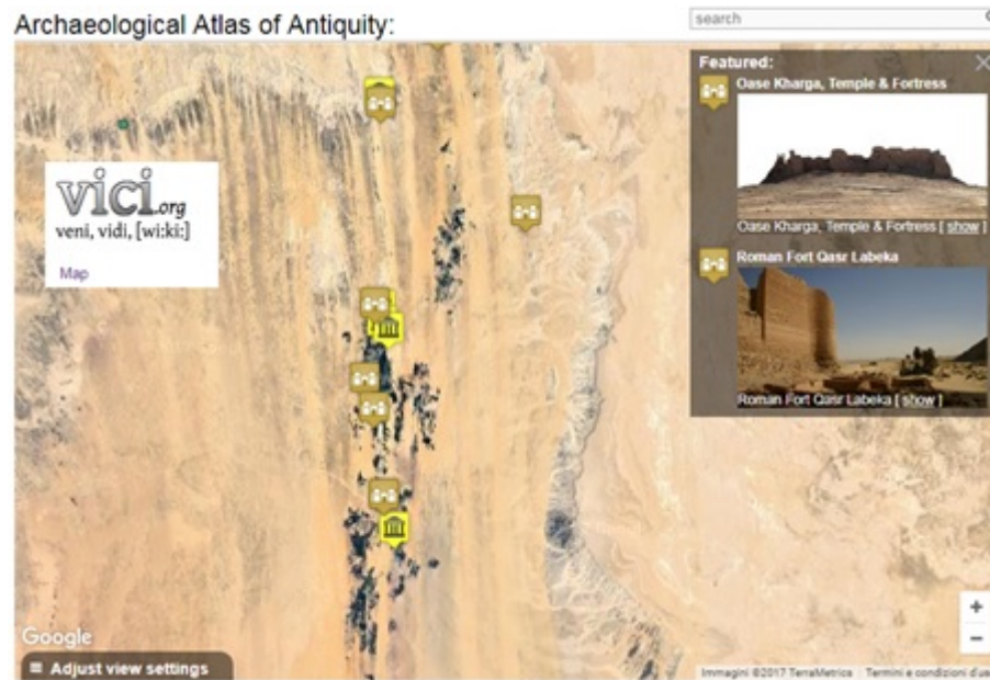
Figure 1: Snapshot of vici.org about the Roman forts of Kharga Oasis.

This Oasis is the southernmost of Egypt's western oases. It is rich of archaeological remains and very interesting for the study of the motion of sand dunes [3-15]. In the Oasis we find a chain of Roman installations to protect the caravan routes that crossed it. We can see the location of some of the Roman forts by means of the web site vici.org. A snapshot of the site is given in the Figure 1.