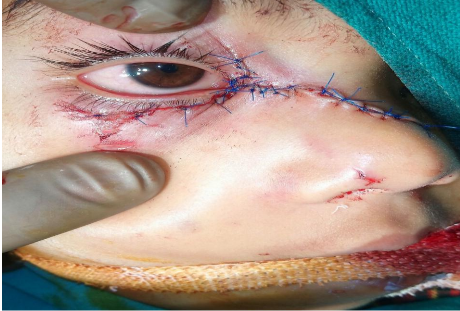
Fig 3:- Primary closure obtained