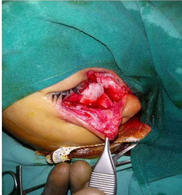
Fig 1:- Lacerated wound