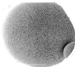
Figure 1: Structure of Microsp sponge.

Microsponges are polymeric delivery systems consisting of porous microspheres that can entrap a wide range of active ingredients such as fragrances, essential oils, sunscreens, emollients and anti fungal, anti inflammatory and anti fungal agents 5 . The microsp sponge delivery system has advantages over other technologies like liposomes and microencapsulation. Microcapsules cannot generally control the release rate of actives. Once the wall is ruptured the actives contained within microcapsules will be released. Liposomes suffer from difficult formulation, lower pay load, limited microbial instability and chemical stability 6 .