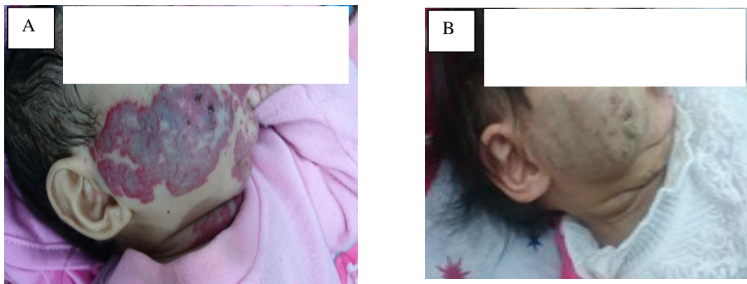
Figure 2: Photographs of case 2 haemangioma at right cheek, lower lip, chin, extended down the neck (A) before (B) 1 year after the initiation of topical propranolol therapy.