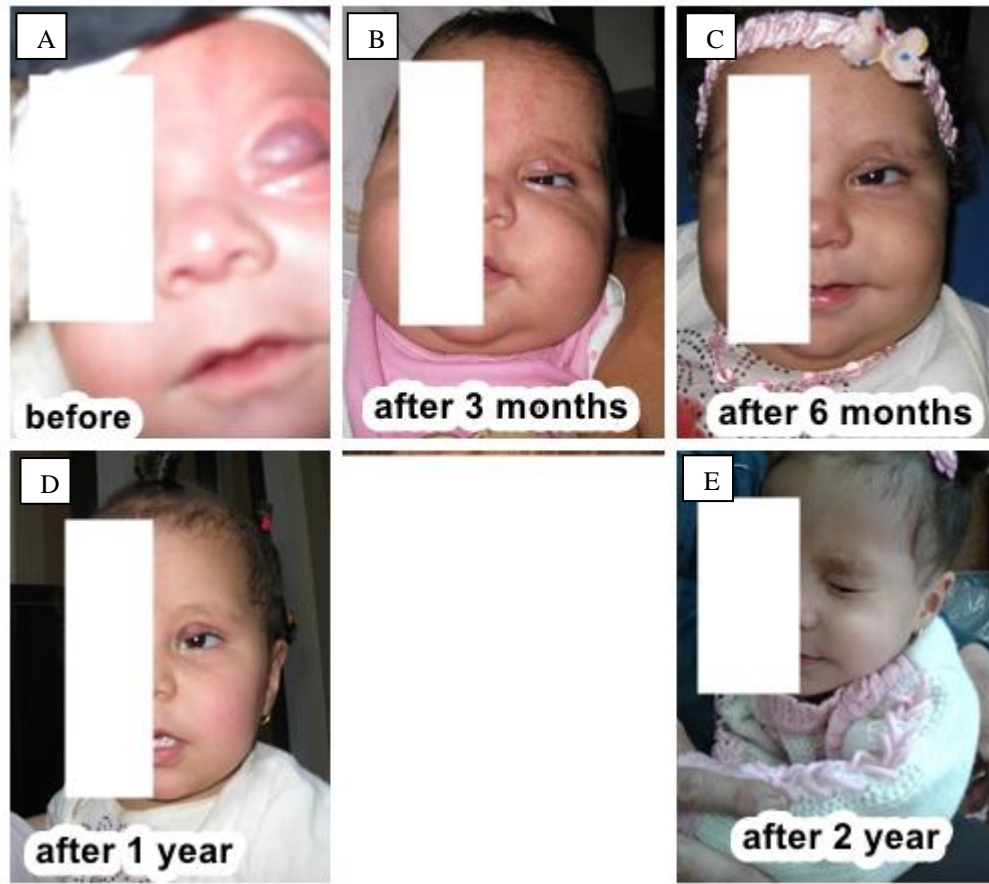
Figure 4: Photographs of case 7 haemangioma at eyelid (A) before (B) 3 months (C) 6 months (D) 1 year of treatment and (E) 2 years after the initiation of intralesional triamcinolone acetonide with dexamethasone therapy.