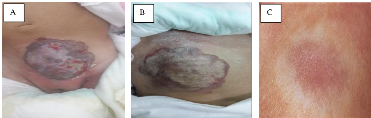
Figure 3: Photographs of case 3 congenital haemangioma at her subumbilical abdominal skin, just suprapubical (A) before, (B) 4 months after the initiation of topical propranolol therapy and (C) at the age of 3 years almost complete involution.