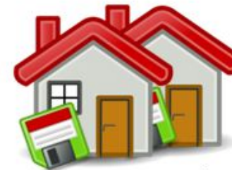
universities and research labs