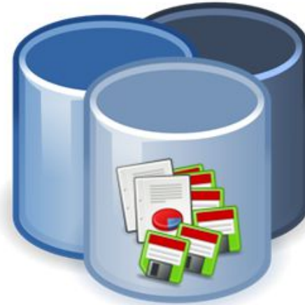
research data repositories