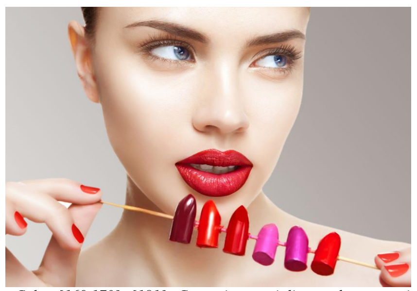
Figure 7: Lip Color [169,170], [181]. Cosmetics specialists and commercials for beauty care products frequently guarantee that lip shading can impact facial skin's clear gentility. At present, we don't have logical proof to either bolster or deny these cases. The luminance differentiate between facial highlights and facial skin is more noteworthy in ladies than in men, and ladies' utilization of make-up upgrades this difference. In highly contrasting photos, expanded luminance complexity improves womanliness and appeal in ladies' countenances, however diminishes manliness and engaging quality in men's appearances. In Caucasians, a great part of the complexity between the lips and facial skin is in redness. Red lips have been viewed as appealing in ladies in geologically and transiently differing societies, perhaps on the grounds that they mirror vasodilation related with endless want.

used to saturate, tint, and secure the lips. A few brands contain sunscreen. Utilizing a preparing lip item, for example, lip emollient or chapstick can anticipate dry lips [6–8], [73].