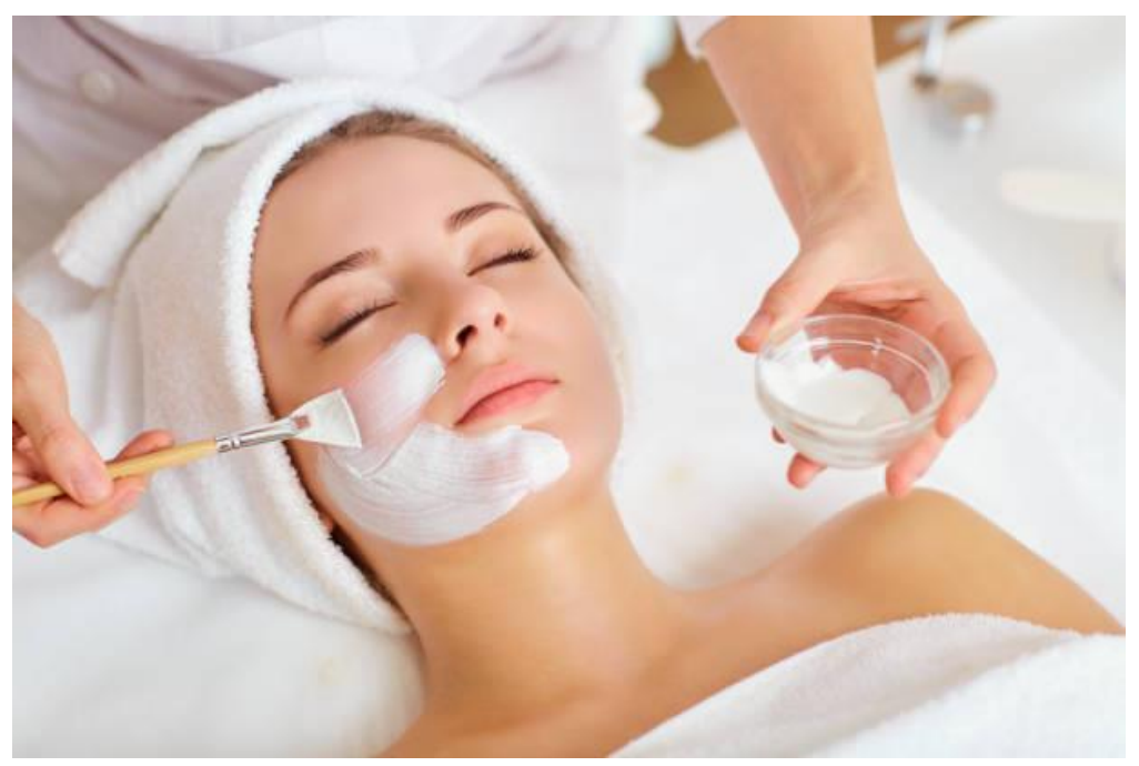
Figure 12: Facial Treatment [177-180]. Facial masks are the most prevalent cosmetic products utilized for skin rejuvenation. are isolated into four gatherings: (a) sheet masks; (b) strip off masks; (c) wash off masks; and (d) hydrogels. Each of these has a few preferences for explicit skin types dependent on the fixings utilized. Strip off facial masks are known for their remarkable attributes innate to the utilization of film-shaping polymers that, after complete drying, make a strong plastic layer taking into consideration the manual evacuation of the item without leaving any buildup. Most earth put together items with respect to the market comprise just of dried dirt powder that should be dampened preceding use. After facial application, the item dries normally, framing a sandy-broke material because of the low union between the dried particles. The most fascinating impacts of aloe vera in topical use are calming, disinfectant, cancer prevention agent, and regenerative. It has been shown that the relationship of green dirt and aloe vera applies a valuable synergistic impact with regards to building up a facial mask as a regenerative guide.

drying. Sheet veils are a moderately new item that are ending up incredibly well known in Asia. Sheet covers comprise of a dainty cotton or fiber sheet with gaps cut out for the eyes and lips and slice to fit the shapes of the face, onto which serums and skin medicines are brushed in a flimsy layer; the sheets might be absorbed the treatment. Veils are accessible to suit practically all skin types and skin objections. Sheet veils are speedier, less require muddled, and no learning or gear for their utilization contrasted with different kinds of face covers, yet they might be hard to discover outside Asia [116-118]. and buv