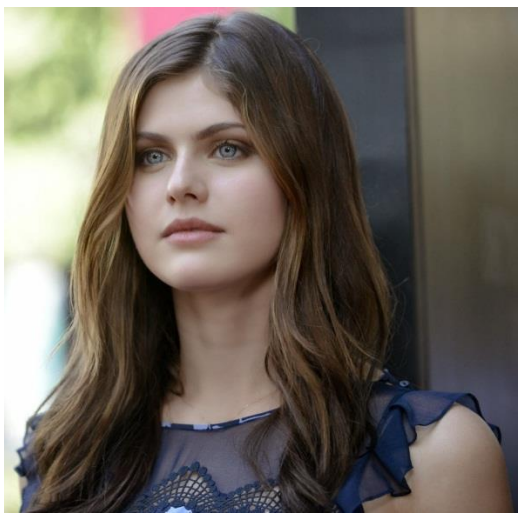
Figure 4: Beauty is in the eye of the beholder, and there is nothing better than a pair of gorgeous eyes [184]. Made from an extract of nightshade berries, also called Atropa belladonna, the resulting eyedrops dilate the pupils, providing a soft and seductive effect, just like in a romance scene of a novel where someone's eyes 'darken with desire.' In Renaissance Italy, this dusky, lustrous appearance of a lady's eyes was considered to be the height of beauty. One drop per eye would block receptors in the muscles of the eye that constrict pupil size. As one might suspect, this comes at an immediate cost to vision, resulting in blurriness and inability to focus on close objects. Though this would wear off over time, prolonged use of belladonna could cause permanent vision distortion or blindness. It also carried the side effect of increased heart rate because, let's not forget, this tincture was made of poison.

Likewise incorporated into the general class of beauty care products are healthy skin items. These incorporate creams and salves to saturate the face and body, sunscreens to shield the skin from harming UV radiation, and treatment items to fix or shroud skin defects (skin inflammation, wrinkles, dark circles under eyes, and so on.). Beautifiers can likewise be depicted by the type of the item, just as the region for application. Cosmetics can be liquid or cream emulsions; powders, both pressed and loose; dispersions; and anhydrous creams or sticks [1-5].