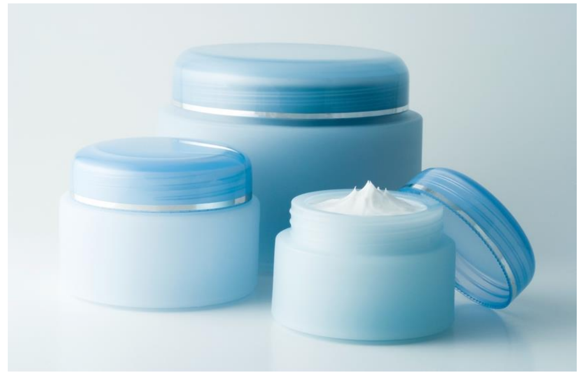
Figure 6: Skin Creams [168]. In general, creams for the skin should protect it from the sun and environmental pollutants, while also treating any specific problems. Look for the highest quality ingredients to ensure a cream's ability to live up to its claims. Enhance the circulation of blood flow by massaging creams into your skin several times a day.

effortlessly. It is helpful to utilize cream by all the age gathering of individuals. Despite the fact that it might be similarly very much connected to non-watery items, for example, wax-dissolvable based mascaras, fluid eye shadows and treatments. In the event that an emulsion is adequately low consistency to be pourable (stream under impact of gravity alone) is alluded to as moisturizer. Creams are emulsions of oil and water. In coming future, further developed advancements and strategies will be utilized for readiness, plan and assessment of creams. Likewise, the interest of natural constituents-based creams is expanding step by step [74–79].