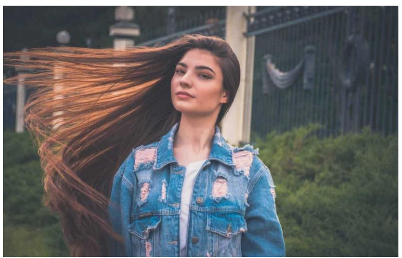
Figure 13: Woman with long beautiful hair [187,188]. The main purpose of shampoo is to remove dirt and oil from the surface of the hair fibers and the scalp, while the main purpose of conditioner is to ensure that the hair is smooth for combing. Shampoos typically contain a primary and a secondary surfactant for thorough cleaning, a viscosity builder, a solvent, conditioning agents, pH adjuster and other non-essential additive components such as fragrance and color for commercial appeal. Conditioners usually contain silicone polymers to increase shine and soften hair, cationic polymers such as quaternary nitrogen compounds to reduce static electricity, bridging agents to increase absorption, viscosity builder, pH adjuster and components for commercial appeal.

reasonable. This exercise in careful control between great cleaning and decorating the hair is a craftsmanship accomplished by blending different fixings in the right extent in the cleanser planning. The cutting edge progresses in science and innovation have made it conceivable to supplant the cleanser bases with complex definition which contain purging operators, specialists alongside practical added additive, stylish substances, added substances and some of the time even medicinally dynamic fixings [121–125].