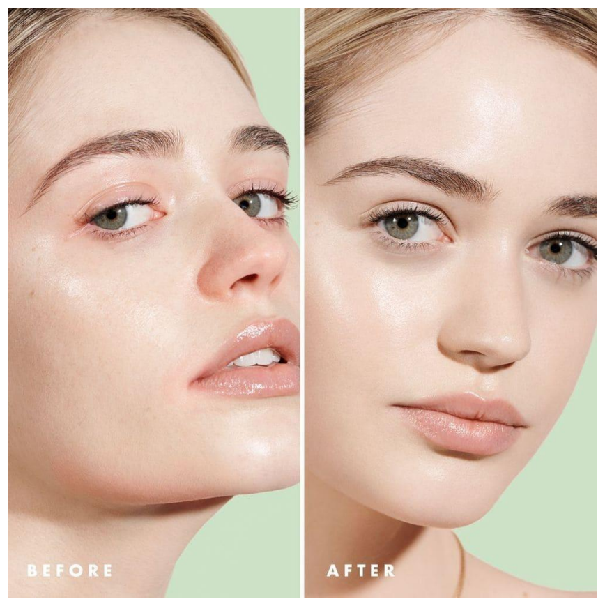
Figure 8: Comparison between Before and After Use of Mineral Primer [84], [171]. Photoaged skin is largely a result of chronic exposure to UV radiation. Photoaging, which causes untimely maturing in the appearance and capacity of the skin, is like sequential maturing in that it is aggregate after some time. Ladies habitually look for viable treatment for their unpredictable pigmentation just as other clinical indications of photodamaged skin. The facial groundwork improved scores for the presence of hyperpigmentation and other photoaging parameters following the main application.

Concealer covers imperfections of the skin. Many people try to manage acne by squeezing pimples, following a thorough skin care routine or wearing foundation. Others trust things will improve on the off chance that they change their eating regimen or open their skin to daylight. Concealer is regularly utilized for any additional inclusion expected to cover skin break out/pimple flaws, undereye circles, and different blemishes. Concealer is frequently thicker and stronger than establishment, and gives longer enduring, increasingly point by point inclusion just as making a crisp clean base for the remainder of the cosmetics. This item likewise lights up the skin and applying under the establishment can expel imperfections and staining on account of