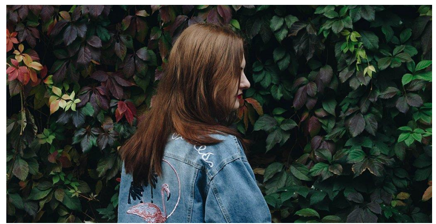
Figure 3: How Do Plant Stem Cells Help Hair Growth? [69,70]. Plant stem cells possess similar genetic factors as human stem cells and can be used to influence the function of certain cells in our skin and hair follicles. Active plant stem cells work to increase the lifespan of hair follicles so that hair can remain in the anagen phase of the hair growth cycle for a longer period of time. Another hair-growth benefit of Asparagus Stem Cells is their ability to block the most common hair-killing hormone, DHT. High levels of DHT, as well as sensitivity to the hormone, are known for causing most male-pattern baldness and even female alopecia. Asparagus Stem Cells can aid the receptors in the skin to block the intrusion of DHT, and therefore minimizing the hair loss caused by it.