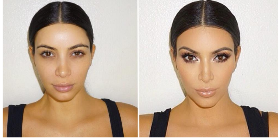
Figure 14: Contouring [182]. Contouring is the newest makeup craze that people just can't get enough of! This trend, made famous by none other than the Kardashian sisters, was created to make face appear slimmer and more sculpted. The basic premise of it is to highlight the areas of face that someone would like to bring out, while shading in the parts she wants to make thinner.

Contouring Contouring is planned to offer shape to a zone of the face. The fact of the matter is to redesign the ordinary shading on the face to give the dream of a more described facial structure which can be acclimated to tendency. Progressively splendid skin hued cosmetics things are used to 'include' areas which are expected to pull in mindfulness in regards to or to be gotten in the light, while darker shades are used to make a shadow. These light and dim tones are blended on the skin to make the misdirection of an increasingly unequivocal face shape. It might be cultivated using a "shape palette" - which can be either cream or powder [102], [112].