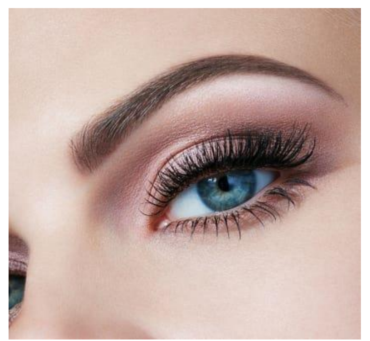
Figure 11: Eye Makeup [174-176]. Kohl was a widely used traditional cosmetic. It may be a pervasive source of lead poisoning in those areas and among individuals from those areas who have immigrated to developed nations. In spite of the way that corrective items experience thorough testing to guarantee they are ok for human use; a few clients report mellow inconvenience following their application. The cutaneous changes, for example, hypersensitive dermatitis, are very much announced, however the visual changes related with eye restorative utilize are less so. Some pigmented restorative items may aggregate inside the lacrimal framework and conjunctivae over numerous long periods of utilization, yet prompt reports of eye uneasiness after application are generally normal. Changes to the tear film and its soundness may happen not long after application, and contact focal point wearers can likewise be influenced by focal point spoliation from corrective items. Furthermore, creams utilized in the counteractive action of skin maturing are frequently connected around the eyes, and retinoids present in these details can effects affect meibomian organ work and might be a contributing component to dry eye malady.

Mascara is utilized to obscure, protract, thicken, or attract thoughtfulness regarding the eyelashes. It is accessible in different hues. A few mascaras incorporate sparkle bits. There are numerous recipes, including waterproof adaptations for those inclined to hypersensitivities or unexpected tears. It is frequently utilized after an eyelash styler and mascara preliminary. Numerous mascaras have segments to help lashes seem longer and thicker [105–107].