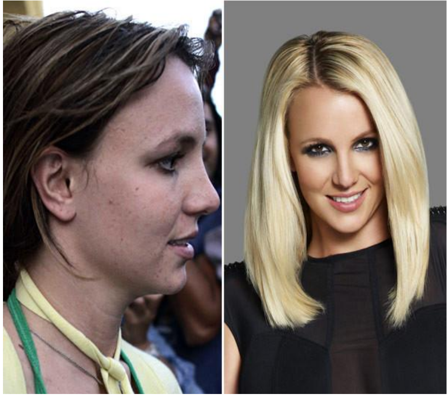
Figure 9: Pimpled and no pimpled Britney Spears [185,186]. At glamorous, Hollywood events, the ".... baby one more time" star Britney Spears' skin appears to be faultless, yet in all actuality, this is a long way from reality: redness, pimples, rashes – the vocalist knows these issues excessively well, direct. Be that as it may, Girls and ladies frequently use concealer or establishment to conceal their pimples. This makes them feel increasingly good out in the open. Young fellows at times utilize unpretentious establishment, powder and concealer too.

Foundation is used to smooth out the face by covering spots, acne, blemishes, or uneven skin tone. These are sold liquid, cream, or powder, or all the more as of late in a mousse. Establishment gives sheer, dewy or full inclusion. matte, Establishment preliminary is connected before establishment to round out pores, make a dewy look or make a smoother wrap up. They for the most part come in cream recipes to be connected before establishment as a base. The most exemplary type of establishment, fluid, offers medium to full inclusion for all skin types, and is a certain flame approach to accomplish a smooth base [2], [91–94].