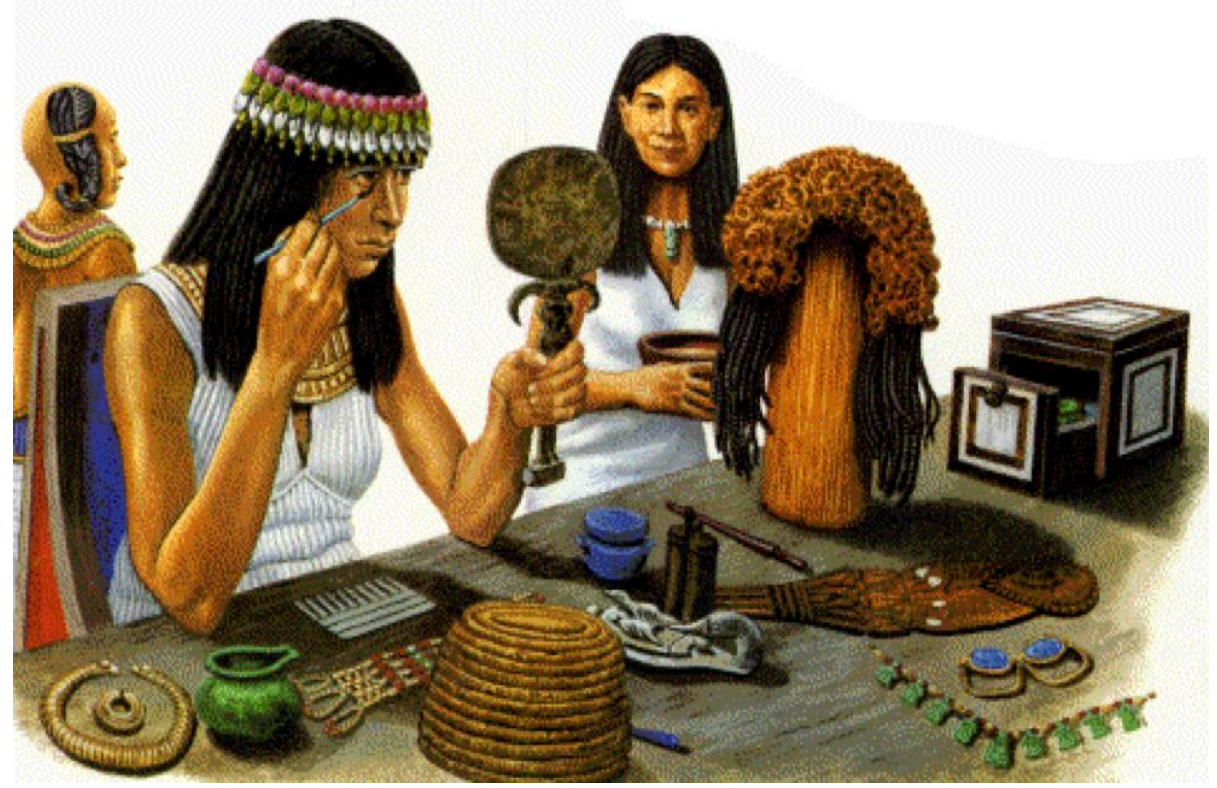
Figure 2: The Beauty of Yesterday: Ancient Egypt [183]. Often referred to as the vainest civilization in history, Ancient Egyptians are known to have played a vital role in shaping modern ideals of beauty. For example, these populations used olive oil, honey and milk to keep their skin wrinkle free, as well as the pigment from clay to create lip and cheek tints to recreate a healthy glow. Another prime example is their use of a charcoal-like substance called Kohl to create thick black lines around their eyes to enhance their natural shape, believing that by following this technique, it would also protect their eyes from the glare of the sun.

normally, they heaped on layer after layer of the brightening establishment to accomplish a look as pale as could be expected under the circumstances. Regardless of the numerous social steps made in the late 1800's and mid 1900's, dim skin was as yet observed as unfortunate. Skin brightening was as well-known as ever and items were made about only for light cleaned ladies. By the 1920's, a move in magnificence beliefs made marginally tanned skin be viewed as attractive. Beautifiers, thusly, pursued this pattern. Tinted face powders and salves that copied a tan were presented.