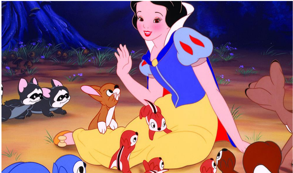
Figure 10: Disney princess, Snow White (Fairy Tale) [172,173]. In the time that Snow White was released it was a common for the majority of women desired to have blush in their faces like her. Rouge originated as a thick paste, and was made from a range of things: from strawberries, to red fruits and vegetable juices, to the powder of finely crushed ochre. As nouns the difference between blush and rouge. is that blush being an act of blushing or blush can be the collective noun for a group of boys while rouge is red or pink makeup to add color to the cheeks; blusher. Blushers, those versatile successors to rouge, help light up a complexion and accent face structure and best features.

ancient Egyptians were the first to incorporate blush into their beauty rituals. The Middle Ages saw a drop in the use of blush, as red cheeks were associated with prostitutes. During the 1500s to the 1700s, blush was made with toxic chemicals. Starting in the 1900s, as America became industrialized, blush began to be mass produced and became much safer to use [98-100].