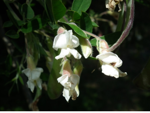
Figure 1: Two endemic legume species found on La Palma. Single-island endemic Lotus pyranthus (left) has become extremely rare, only few clones survived, and these need to be protected by fences from introduced rabbits. Archipelago endemic Chamaecytisus proliferus (right), in contrast, shows the economic potential of endemic species. It has become an important fodder plant in Australia, New Zealand and Africa. In consequence both need to be preserved but for different reasons.