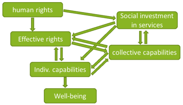
Figure 2 From human rights and social investment in capabilities to individual well-being

Source: developed for RE-InVEST (Nicaise et al., 2017: 2)