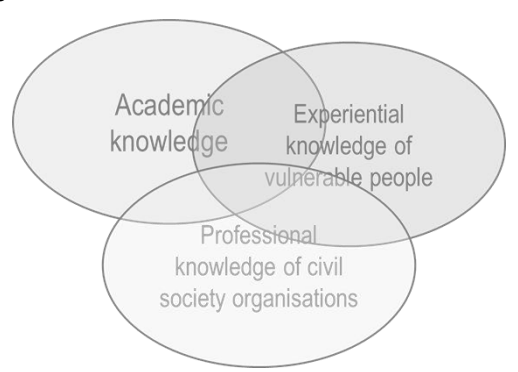
Figure 0.2 Merging of knowledge

This methodology was applied for the in-depth case study of water in Chapter 3. For this purpose, the RE-InVEST team joined forces with pre-existing dialogue processes at grassroots level, conducted by the Belgian Combat Poverty Service and (mainly) the Flemish federation of community work Samenlevings-opbouw Vlaanderen. We thank all parties for their active contribution to this report.