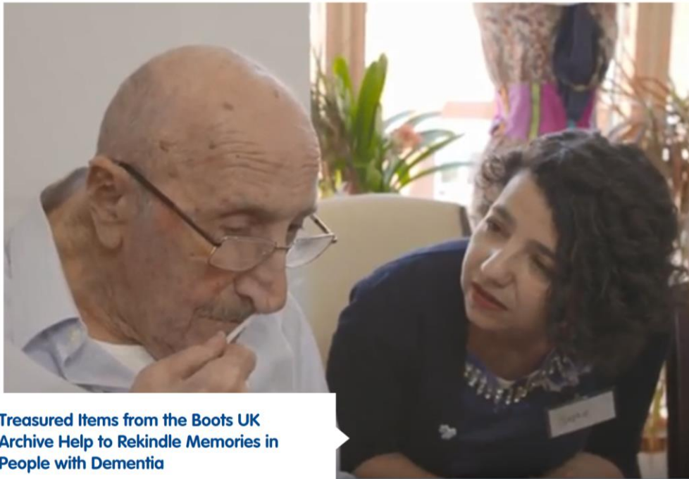
Treasured Items from the Boots UK Archive Help to Rekindle Memories in People with Dementia