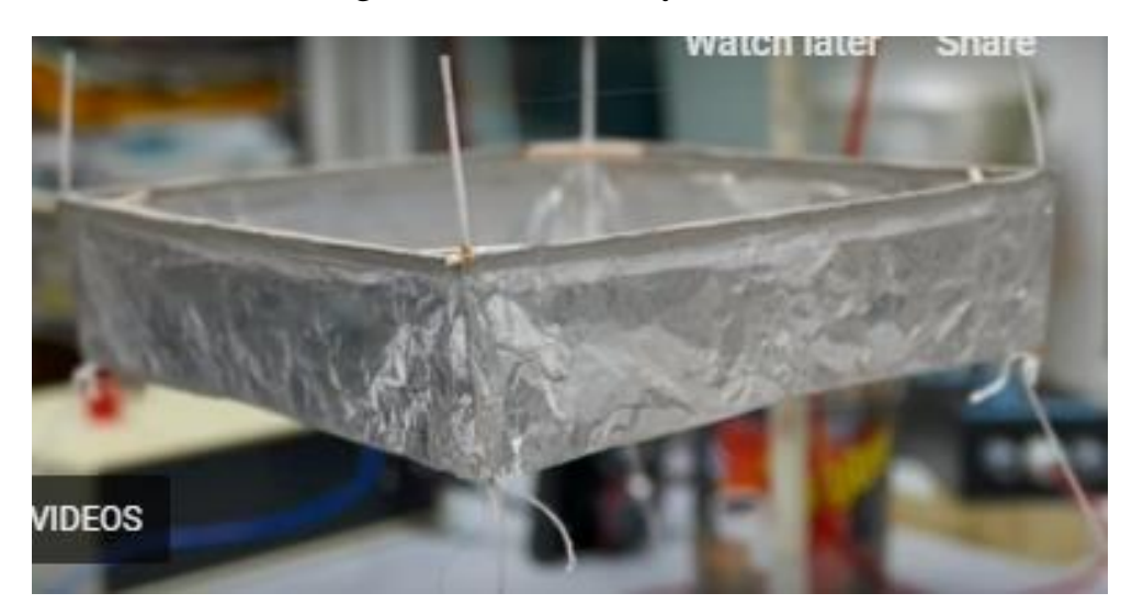
Fig. 2 (from [4], time 6:37)

According to the proposed theory, the author calculates the results of experiments with HVE. The well-known parameters HVE (dimensions, mass, current, voltage, electrical capacity) is calculated lifting speed. If it is equal to the measured one, then it can be argued that the theory is valid.