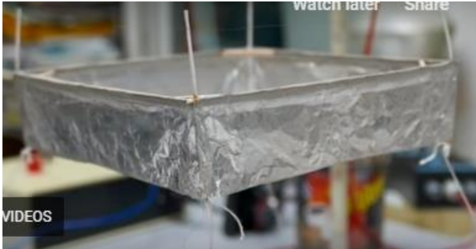
Fig. 2 (from [4], time 6:37)

According to the proposed theory, the author calculates the results of experiments with HVE. The well-known parameters HVE (dimensions, mass, current, voltage, electrical capacity) is calculated lifting speed. If it is equal to the measured one, then it can be argued that the theory is valid.