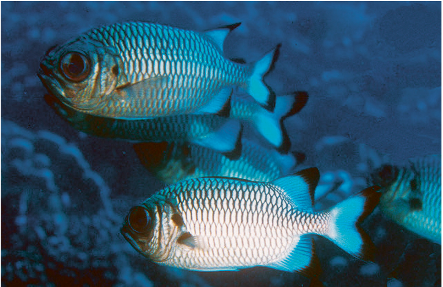
Figure 6. Myripristis adusta , Kiritimati, Line Islands (John E. Randall).