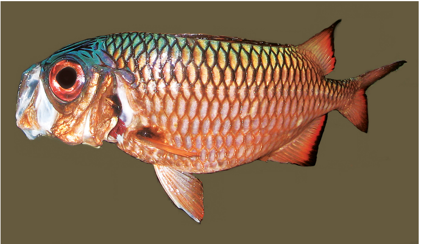
Figure 5. Myripristis adusta , Kailua-Kona pier, island of Hawai'i (Tasha Palmer).