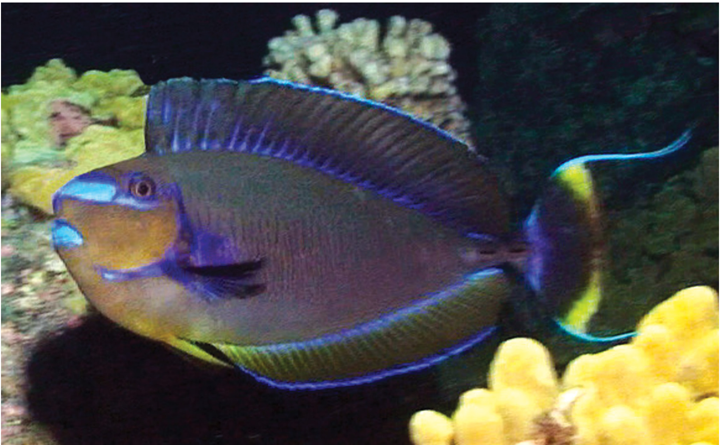
Figure 11. Naso vlamingii , Kona, island of Hawai‘i.

Hawaiian records. There are two new records for this species, both based on underwater photographs. Keller Laros took the photograph of Figure 11 on the reef at Garden Eel Cove, Makako Bay, Kona coast of the island