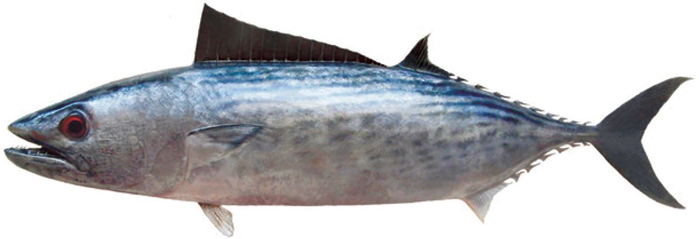
Figure 13. Sarda chiliensis lineolata , Kane‘ohe Bay, O‘ahu (John E. Randall).

Remarks. Collette & Nauen (1983) recognized two subspecies of the Eastern Pacific Bonito Sarda chiliensis : the northern S. chiliensis lineolata (Girard), from southern Alaska to Cabo San Lucas, Baja California and the southern S. chiliensis chiliensis (Cuvier) that ranges from Mancora, Peru to Talcahuano, Chile. The two subspecies are separated in the tropical zone by the wide-ranging Sarda orientalis (Temminck & Schlegel). The all-tackle angling record for the northern subspecies is 10.07 kg for a fish caught off Malibu, California in 1978. The species is described as neritic and epipelagic (Collette & Nauen 1983).