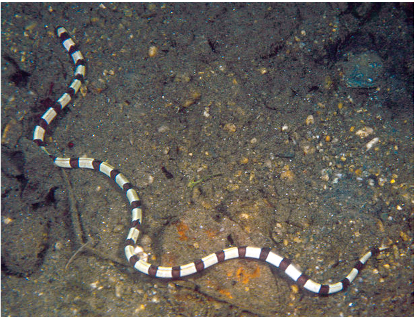
Figure 2. Myrichthys colubrinus , estimated length of 40 cm, Papua New Guinea (John E. Randall).

Hawaiian Record. In July 2010, William T. Brooks took the underwater photograph of Figure 1 of an adult individual of Myrichthys colubrinus moving over the sand bottom at a depth of about 1.5 m off Poipu Beach, Kaua‘i. Its excursion in the open was brief. Brooks noted the exact location and planned to try to collect the eel the next day, but rough seas forced cancellation. This species probably ranges over a broad area as it forages on