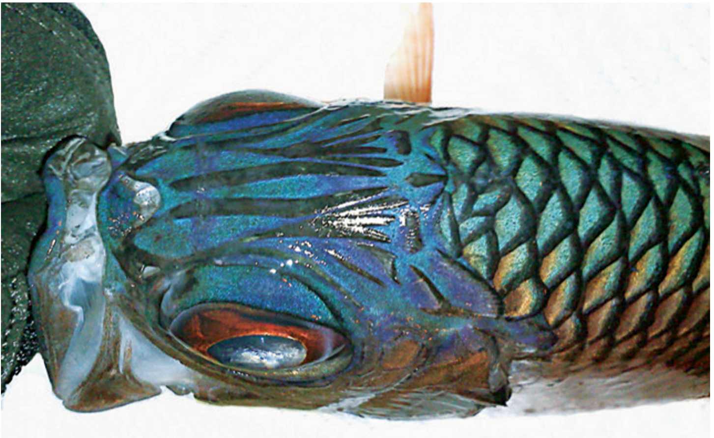
Figure 4. Myripristis adusta , Kailua-Kona pier, island of Hawai‘i (Ian Kau).

Remarks. Wide-ranging in the Indo-Pacific: in the western Indian Ocean from the Red Sea and African coast east across the Indian and central Pacific Oceans to the Line Islands, Society Islands, and Tuamotu Archipelago; in the western Pacific north to the Ryukyu Islands of Japan and south to the Great Barrier Reef and New Caledonia. Usually found by day in small aggregations in caves or beneath ledges, mainly in lagoons or bays, some as