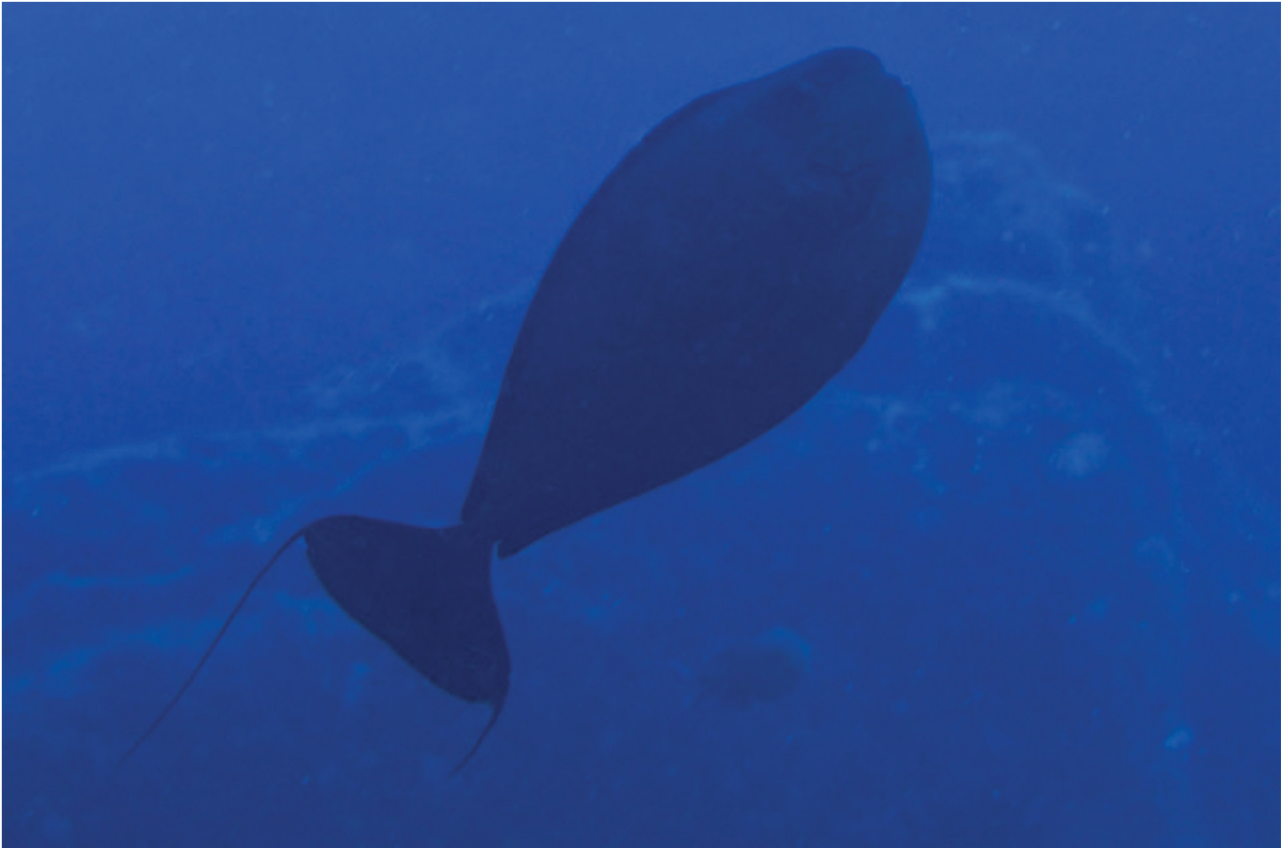
Figure 12. Naso vlamingii , Ni'ihau, Hawai'i (Andrew Gray).

of Hawai'i on 15 September 2014. The second author took the photograph of Figure 12 while on a drift dive off the small island of Lehua, 1.1 km north of Ni'ihau, at a depth of about 20 m. He gave the approximate location as 22.018° N, 10.10° W. Although the photograph is little more than a silhouette, there is no other species of Naso with which it might be confused.