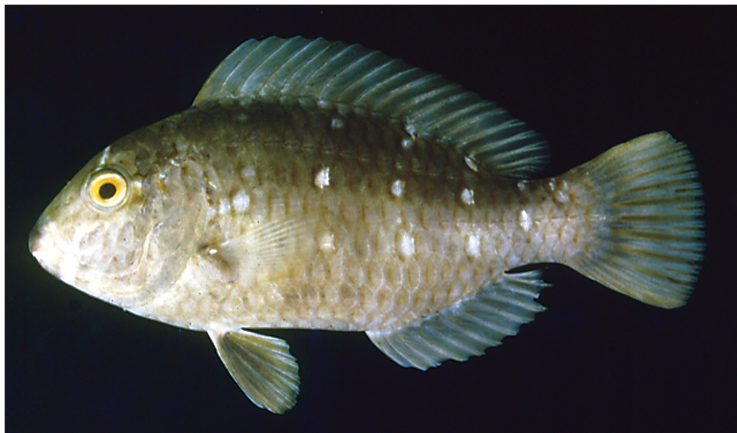
Figure 10. Bolbometopon muricatum , juvenile, 13.4 cm, Java, Indonesia (John E. Randall).