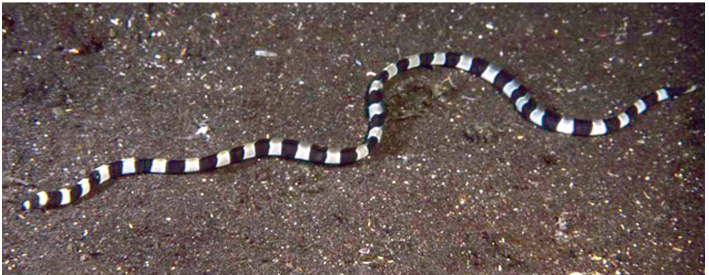
Figure 1. Myrichthys colubrinus , Kauaʻi, Hawaiʻi (William T. Brooks).

Diagnosis. Vertebrae 190–202; body very elongate, depth 51–68 in total length; head length 17–20 in total length; snout rounded, 3–5 in HL; head and trunk 2.0–2.3 in total length; origin of dorsal fin on head, predorsal