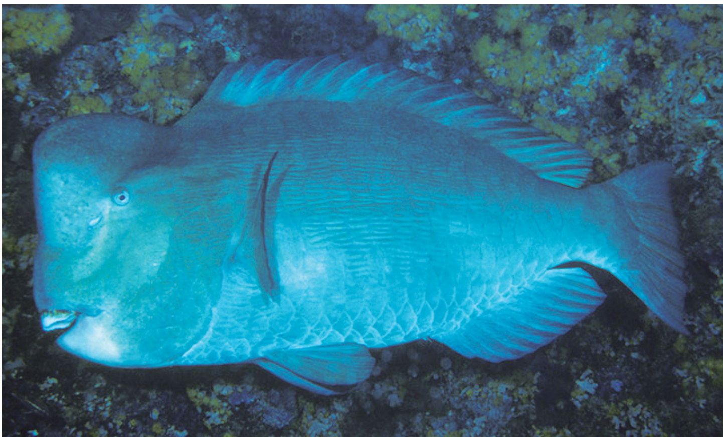
Figure 8. Bolbometopon muricatum , terminal-phase male, night, Sabah, Malaysia.