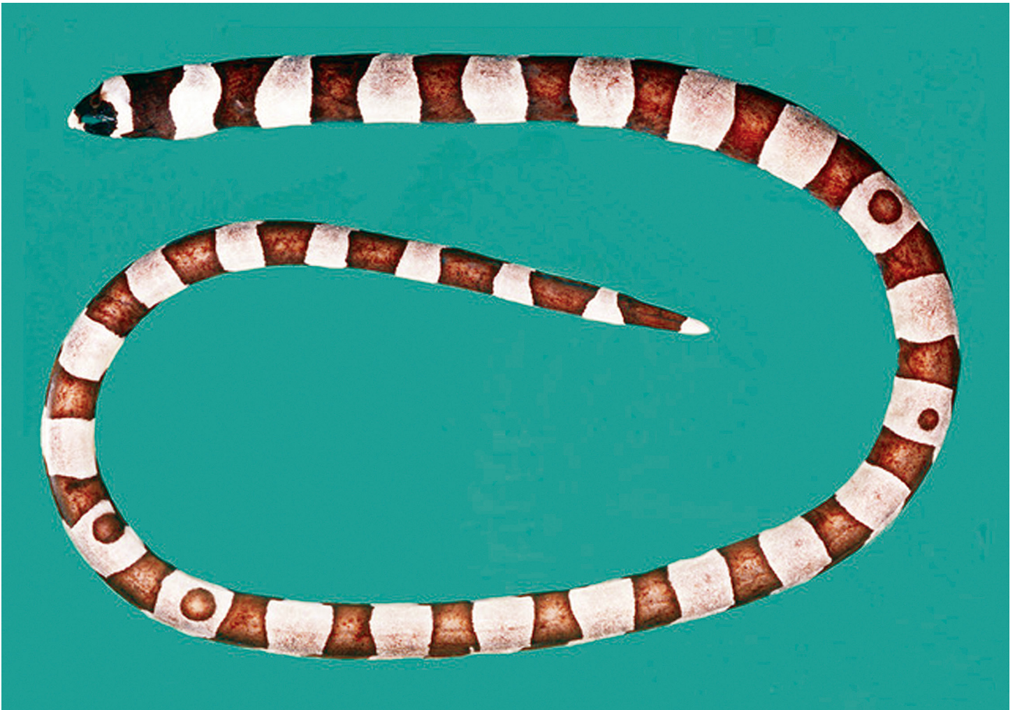
Figure 3. Myrichthys colubrinus , 73 cm, Papua New Guinea (John E. Randall).

and beneath open sand or sand-and-rubble substrata, so chances of successful collection would have been slim.