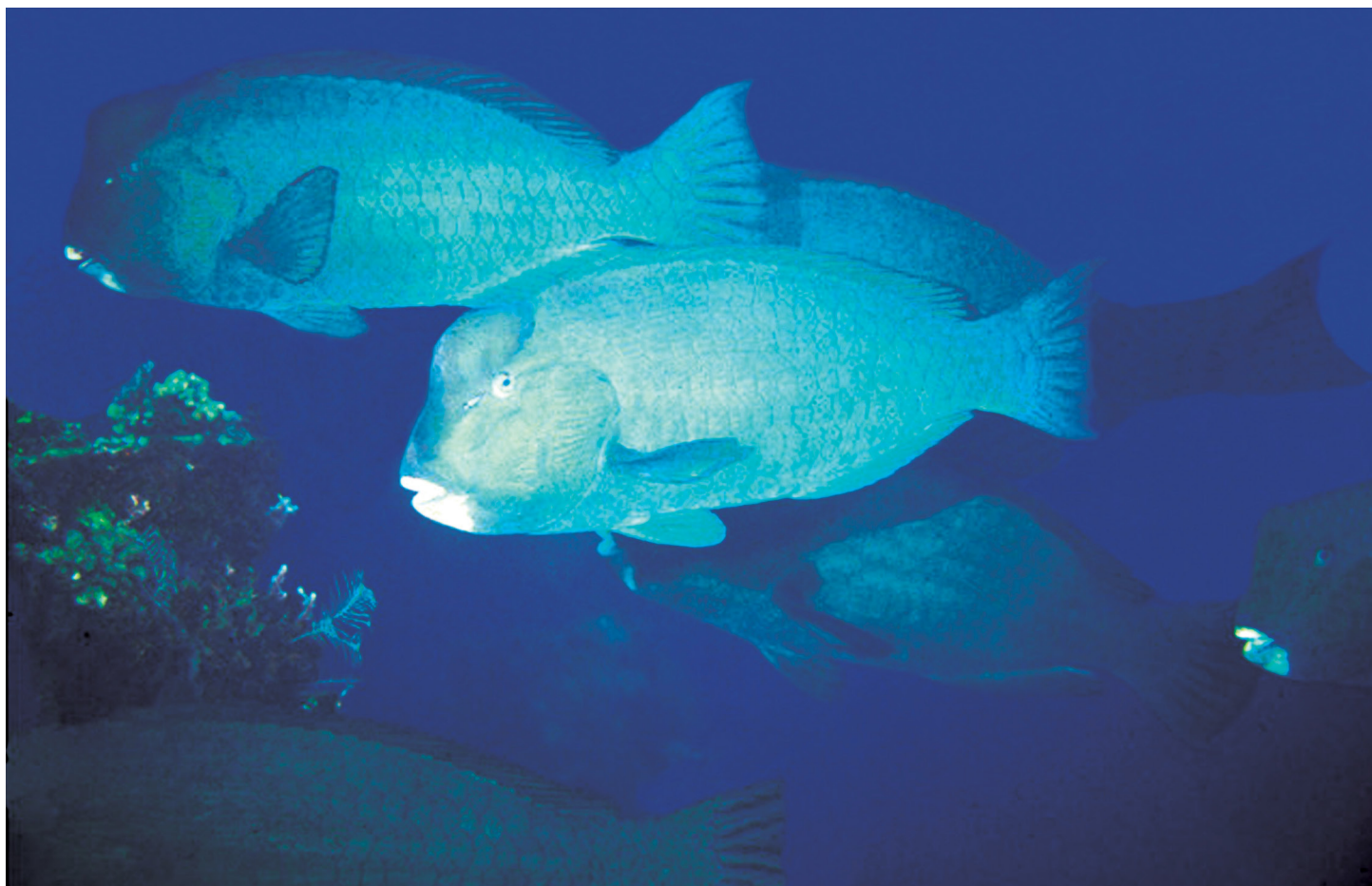
Figure 9. Bolbometopon muricatum , terminal-phase males, Bali, Indonesia (John E. Randall).