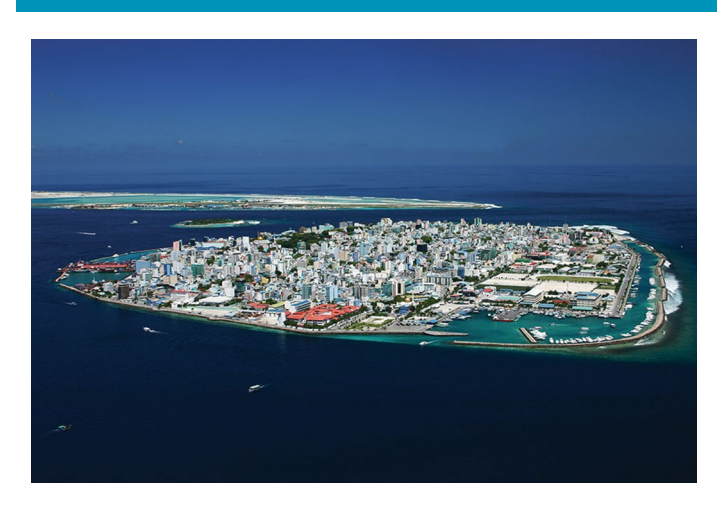
Fig. 4 | Malé, the capital island of The Maldives. High and increasing population densities in Malé have led to the reclamation of the nearby island of Hulhumalé, which can be seen in the background of the photo.

Finance barriers. Island construction was financed by the Government of the Maldives and a concessional loan from the Saudi Fund for Development<sup>47</sup>. Land reclamation is generally attractive for investors, because investments can be paid back in the short term through real-estate revenues generated on the newly created land. In addition, the Maldivian economy has been attractive for investors because it has been growing at an average rate of 7.4% over the last 30 years<sup>48</sup>.