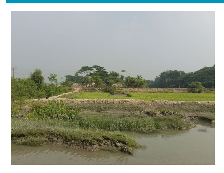
Fig. 2 | Polder system in coastal Bangladesh south of Khulia. Polders are low-lying tracts of land enclosed by dikes, which are widespread in densely populated deltas with the main goal of promoting agriculture. The polder dikes and drains will require substantial upgrades to remain effective under SLR.

the options mentioned above are expected to have benefits exceeding their costs, although it is hard to find detailed analyses demonstrating this.