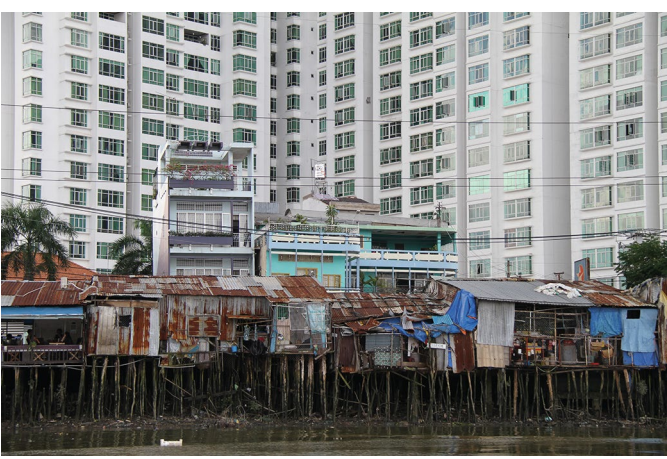
Fig. 3 | Stilt houses on a river bank in Ho Chi Minh City, Vietnam. This flood-mitigation measure is widely applied by the poorest, most exposed and most vulnerable part of the population and stands in stark contrast to the new high-rise residential apartments in the background.

Technological limits. There are no technological limits to these adaptation measures. Some challenges relate to the availability of adequate sand volumes for nourishment<sup>31</sup>, because the sand used