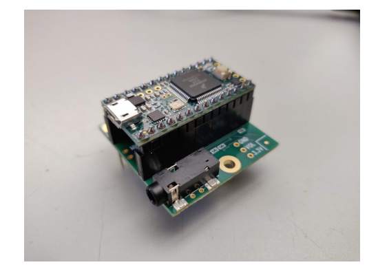
Figure 1. The Teensy 3.2 and its audio shield.

In parallel of that, the rise of embedded Linux platforms with their potential applications to real-time audio signal processing also impacted the way we approach digital lutherie [1]. A series of tools (both hardware and software) such as Satellite CCRMA [2] and the BELA<sup>2</sup> [3] (to only name a few) have been exploiting the potential of these new technologies. The BELA is especially interesting to us as it adds audio-rate analog I/Os and low-latency audio processing capabilities to the BeagleBone Black.<sup>3</sup> More specific applications and experiments have also been