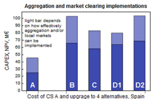
Figure 2 Cost estimate of aggregation and market clearing implementations in Spain.