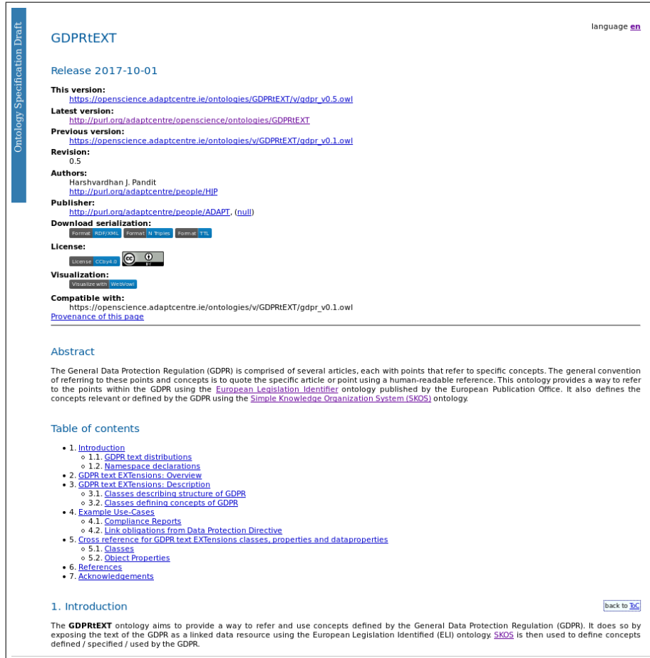
Fig. 2: Documentation for GDPRtEXT Ontology generated using Widoco

with the GDPR articles they represent. This is shown using the EARL 23 vocabulary for expressing test results. The second example shows the linking of GDPR obligations with the previous data protection law, which is described in more detail in the next section. We have also used GDPRtEXT to link provenance terms with their definitions in relevant GDPR articles [19].