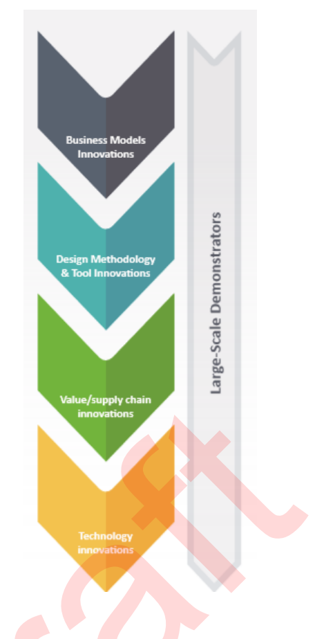
Figure 3: The work structure to be implemented in ReCiPSS.