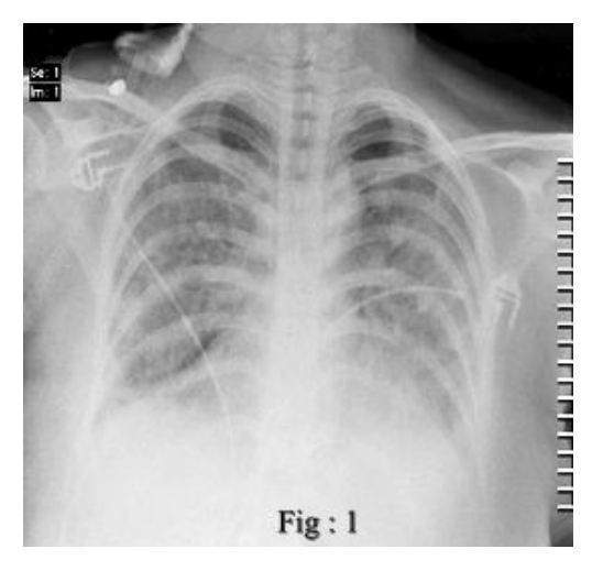
CXR (Fig: 1) revealed diffuse bilateral haziness

ulcers, malar rash, photosensitivity hair loss redness of eyes, serositis, seizures, weakness (Proximal/distal), skin tightening, chest pain, palpitation, hemoptysis, COPD, bronchial asthma, pulmonary embolism or any thromboembolic events (CVA, MI, amaurosis fugax, limb ischemia or recurrent pregnancy loss) in other system in the past. Her general examination revealed a dyspnoeic, febrile (102.3 F) patient with tachycardia (124b/min - regular), B.P (140/90mmHg), tachypnea (22/min). Chest examination revealed bilateral extensive rales and a few rhonchi. Other systemic examination was unremarkable. Initial blood investigations at the time of admissions were Hb - 14.1gm/dl, TLC – 32,100 cells/mm3 with 90% PMNs, platelet count – 3,47,000 cells/mm3, Na – 139 mmol/L; K – 3.9 mmol/L; Creatinine – 0.9 mg/dl; Urea – 21 mg/dl, serum protein – 5.46g/dl; albumin – 2.6g/dl; globulin – 2.96g/dl; bilirubin – 0.76mg/dl; AST – 122 IU/L; ALT – 208 IU/L; Alkaline Phosphatase – 117 IU/L. Arterial Blood Gases revealed pH – 7.48; pO2 – 44; pCO2 – 30; HCO3 – 18. ECG was fine.