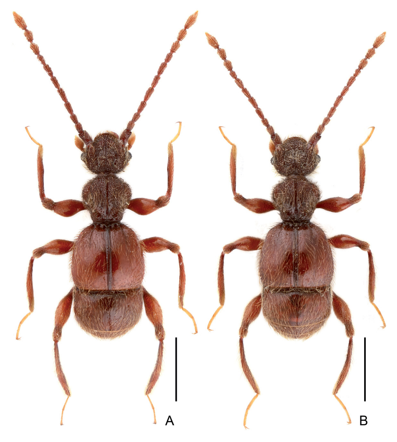
Fig 1. Dorsal habitus of Smetanabatrus ghecu sp. n. (A) Male. (B) Female. Scales: 1.0 mm.

composed of about 55 facets; with large ocular canthi (Fig. 2A); maxillary palpi (Fig. 2E) with greatly broadened palpomeres IV; antennomeres each elongate, clubs indistinct (Fig. 1A). Pronotum nearly cordiform, wider than long, PL 0.69-0.71 mm, PW 0.74-0.78 mm, coarsely granulate; with large antebasal spines, with deep median sulcus, thin, curved discal carinae, and sinuate lateral sulci; lateral margins rounded, gradually