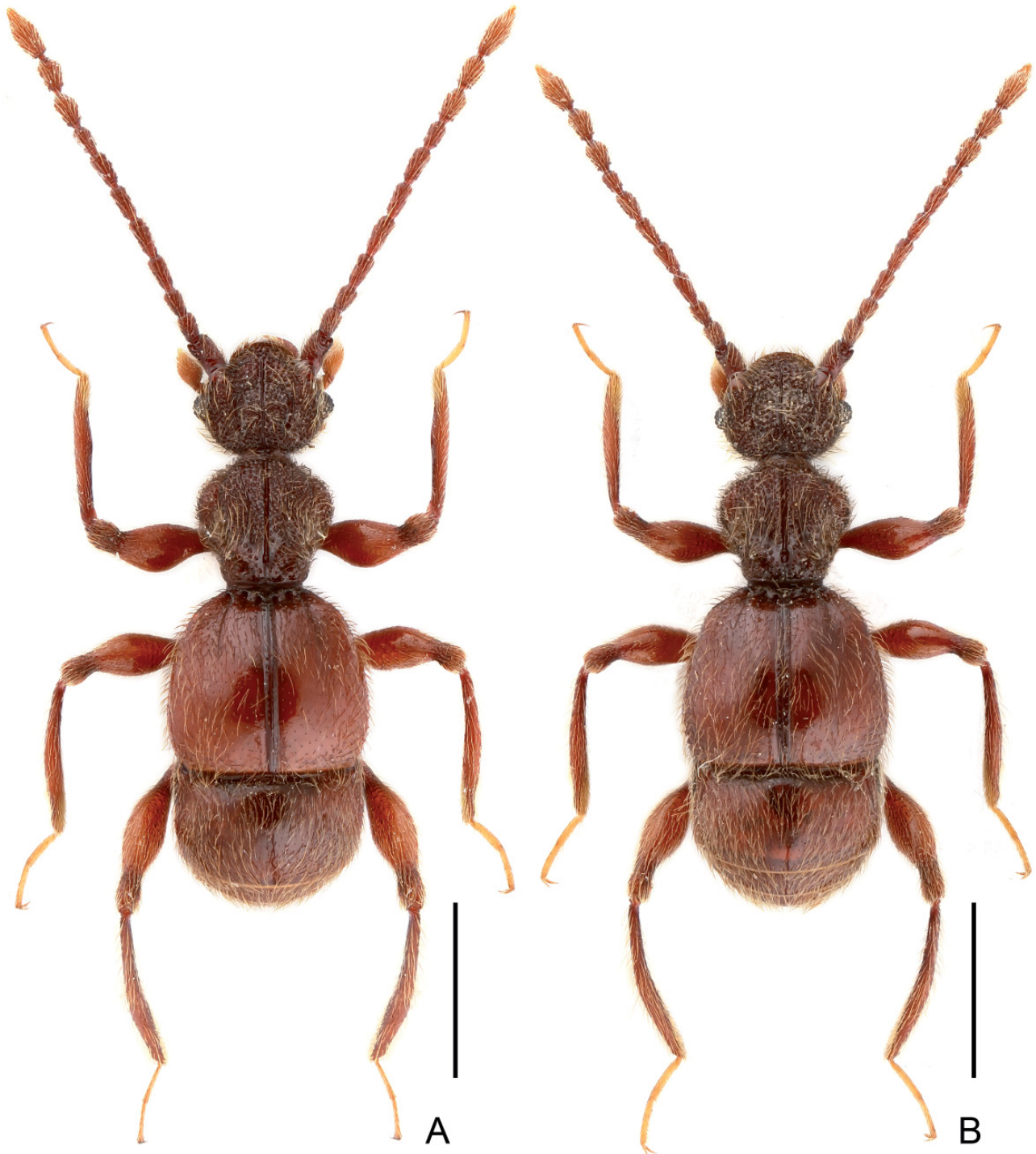
Fig 1. Dorsal habitus of Smetanabatrus ghecu sp. n. (A) Male. (B) Female. Scales: 1.0 mm.

composed of about 55 facets; with large ocular canthi (Fig. 2A); maxillary palpi (Fig. 2E) with greatly broadened palpomeres IV; antennomeres each elongate, clubs indistinct (Fig. 1A). Pronotum nearly cordiform, wider than long, PL 0.69-0.71 mm, PW 0.74-0.78 mm, coarsely granulate; with large antebasal spines, with deep median sulcus, thin, curved discal carinae, and sinuate lateral sulci; lateral margins rounded, gradually