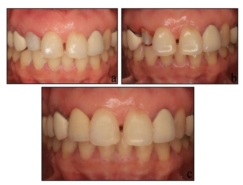
Figure 7:-(a) Post and Crown build up after extrusion, (b) Crown preparation, (c) After all ceramic crown placement