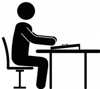
Fig. 1 Experimental setup in all three studies. Participants sat in front of a table on which a touchscreen monitor was positioned in portrait orientation with an angle of approximately 15°

The task was programmed in unity ( https://unity3d.com ) and displayed on a 23-inch iiyama ProLite T2336MSC-B2 touchscreen monitor with a resolution of 1920 × 1080 pixels. Participants were seated in front of a table on which the touchscreen monitor was positioned in portrait orientation with an angle of approximately 15° relative to the horizontal table top (Fig. 1). Each trial started with presentation of a hand symbol in the center of the screen. When participants placed five fingers on the hand symbol, two pictures simultaneously appeared on the screen, which were either a food picture on the top (distal part of the screen) and an object picture on the bottom (proximal part of the screen) or vice versa (Fig. 2a). Participants were instructed to reach for the target picture. Instructions then read “When the [target] picture is in the lower half [of the screen], push it away from yourself. When the [target] picture is in the upper half [of the screen], pull it towards you.”. When participants reached the target picture, the other picture disappeared so that the target picture could be moved to the other side of the screen.