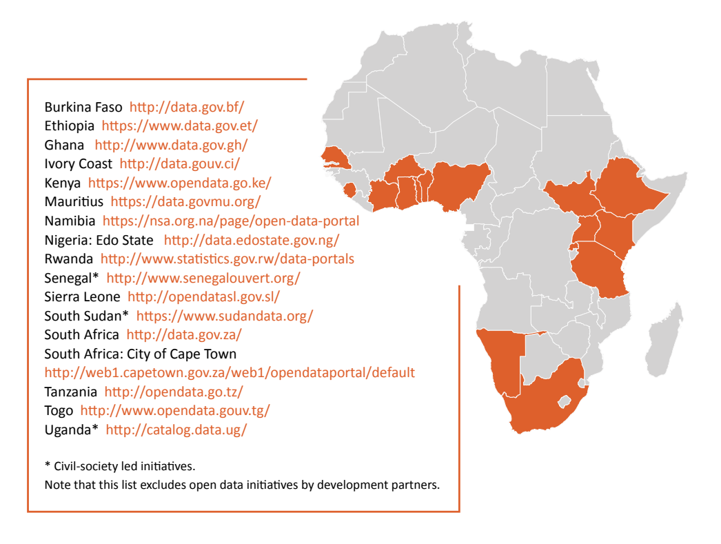
Figure 2: Countries in Sub-Saharan Africa with local open data initiatives

This "government/civil society/development agency" model can easily be extrapolated to many African country contexts. While relationships and the influence of open data stakeholders may vary in extent within the context of each country, they ultimately fulfil more or less the same role, although this model has started to become outdated as African open data ecosystems have evolved to include more actors with broader and multi-level interactions. For example, citizens have begun to feature more prominently in the open data ecosystem: first, as the ultimate beneficiaries of the value created by open data and, second, as the producers of alternative open data via crowdsourcing activities.