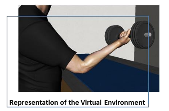
Figure 2. Illustration of User's Perception and Virtual Environment.

The VR environment was developed with the Unity3D 5 game engine for the Samsung Gear VR HMD and ran on a Samsung Galaxy S6 phone. The 3D models were generated in Maya version 2016 (Autodesk Inc). The system allowed customizing the gender, the dominant hand, the skin, the t-shirt colors, and the weights on the dumbbell. In order to provide a sense of agency, the VR was connected to a Microsoft Band (Microsoft Inc.) that tracked the movement of the participant's arm (rotation X and Y axis) using its built-in gyroscope. The data were used to animate the virtual arm in real time to match the movement of the actual arm.