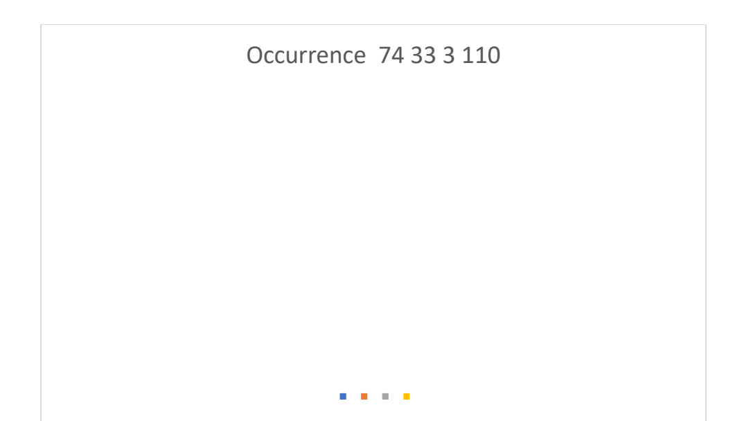
Table 3: Information Points: