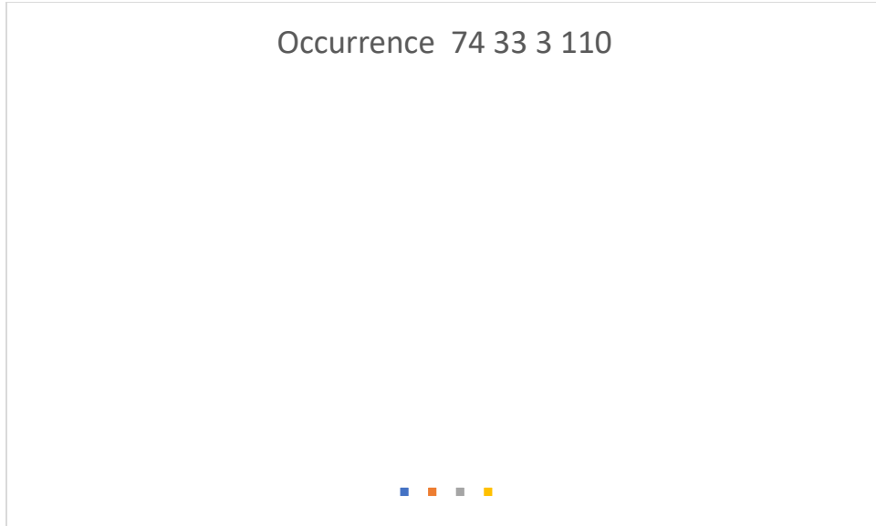
Table 3: Information Points: