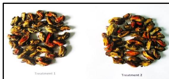
Figure 2:- Physical appearance of developed spicy-flavored vacuum fried tahong chips using two levels of chili.

The sample products of spicy-flavored vacuum fried tahong chips using two levels of chili are shown in figure 2.